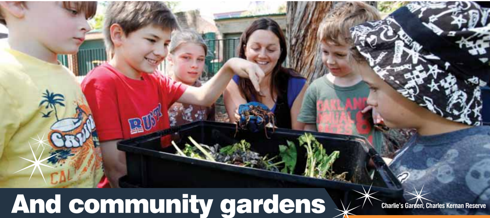
Charlie's Garden, Charles Kernan Reserve