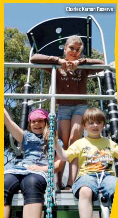
Charles Kernan Reserve