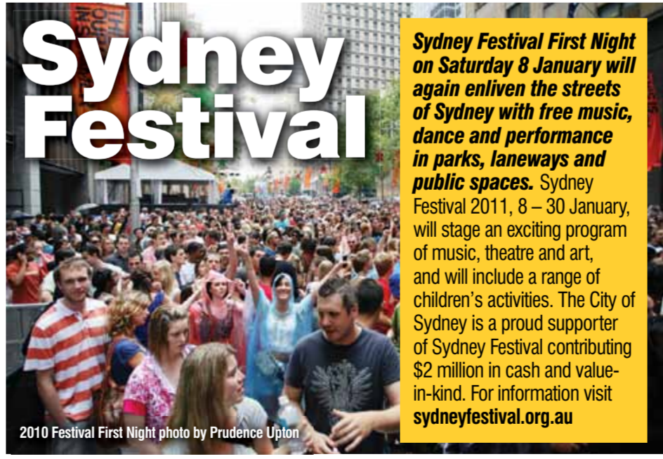
2010 Festival First Night

If you missed our two recent City Talks on 'Sydney's Energy Revolution: Building a low-carbon city' or 'World Class Streets: Transforming city streets into vital public spaces' you can watch the full podcasts at cityofsydney.nsw.gov.au/podcasts