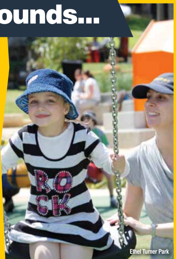
Ethel Turner Park

Our two newest playgrounds have been opened in Charles Kernan Reserve, Darlington and Ethel Turner Park, Paddington taking the total number of playgrounds in the LGA to 85. We worked with local residents to establish a communal food garden in Charles Kernan Reserve and created a playground with exciting new equipment and facilities for children up to 12 years. At Ethel Turner Park we reused sandstone that was uncovered during construction and installed a new nature play area, swing set, slides and a new shade pergola. For more information on the City's park improvements visit cityofsydney.nsw.gov.au/development