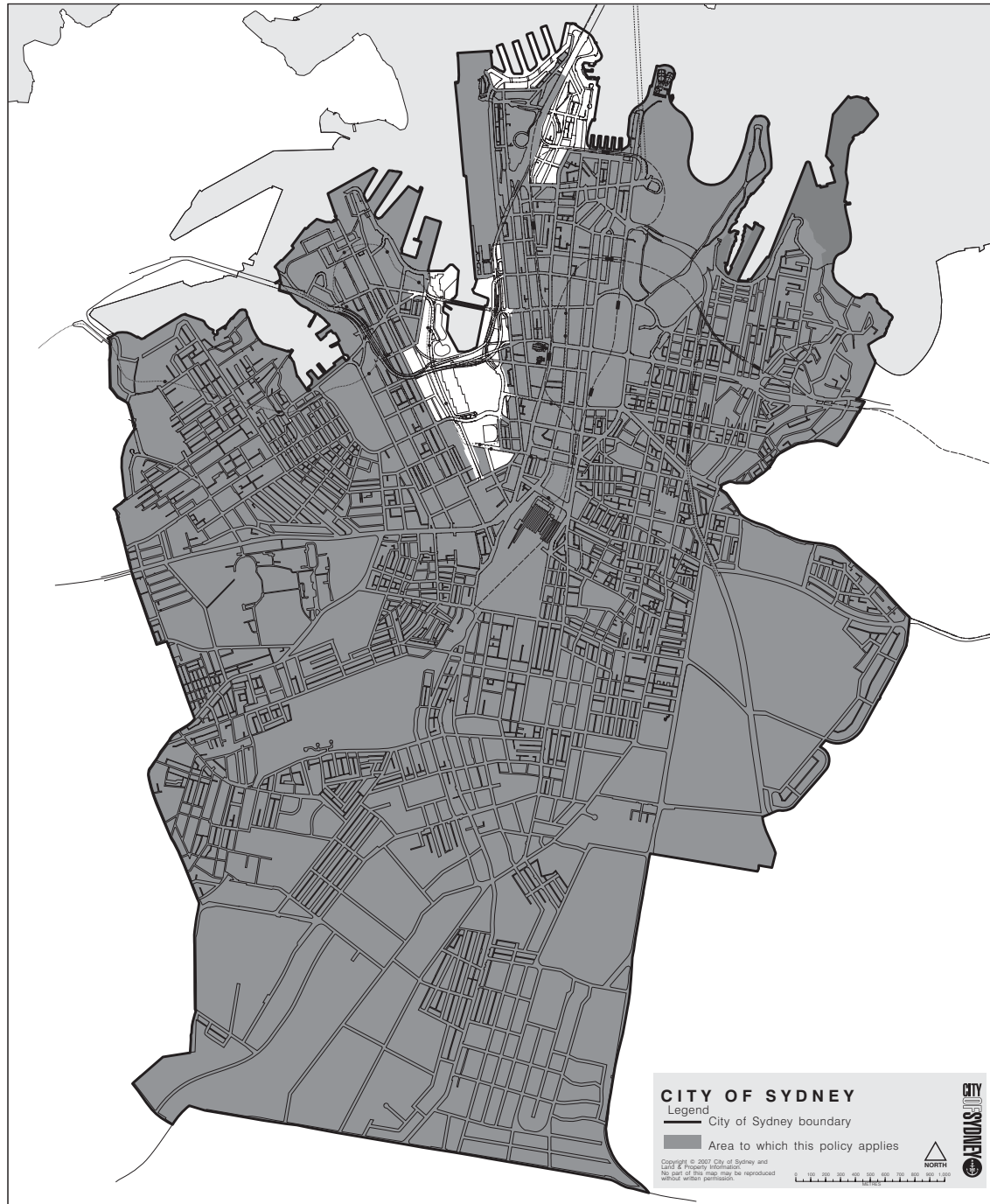
Figure 1 Area to which this policy applies