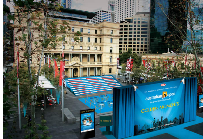
Customs House Square – Forecourt

To view past Customs House Square venue hires please see – http://www.sydneycustomshouse.com.au .