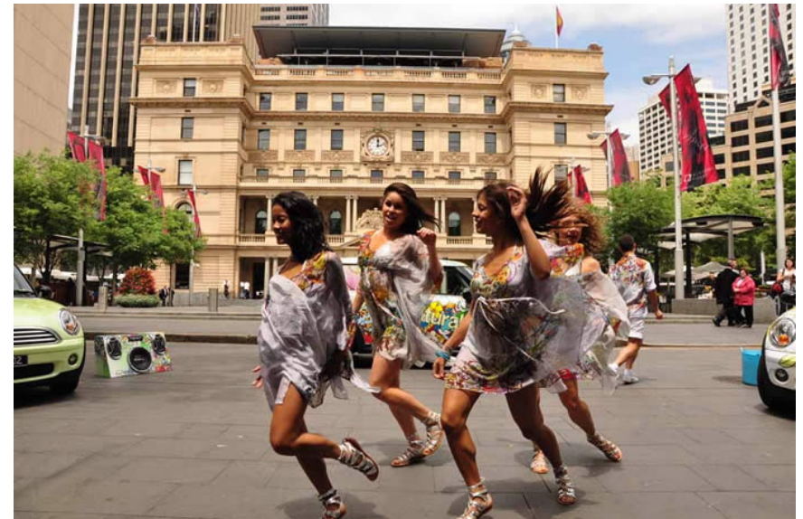
Customs House Square – Alfred Street