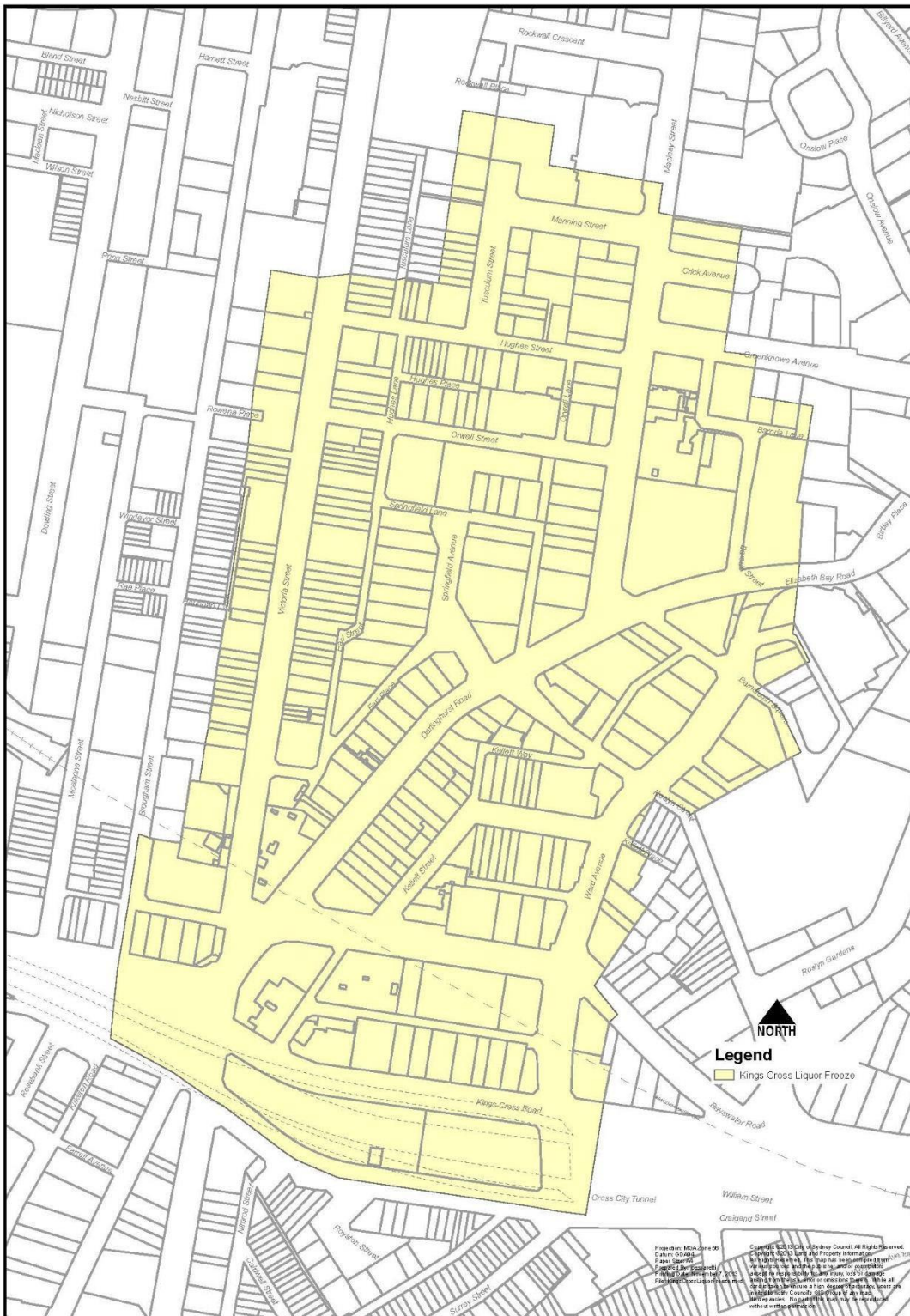
Kings Cross Precinct Liquor Accord & Liquor License Freeze Zone