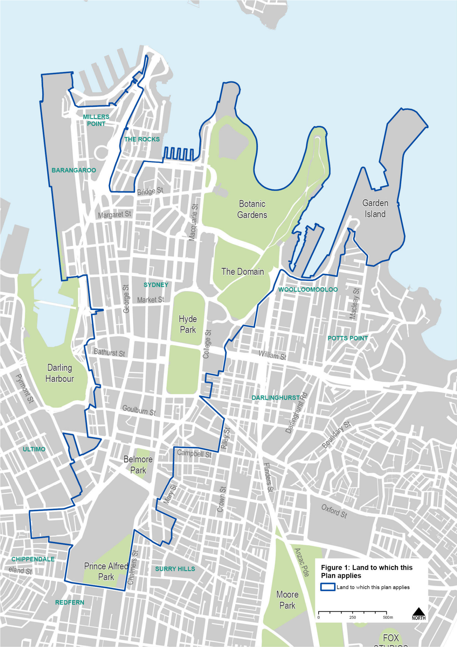
Figure 1: Land to which this Plan applies