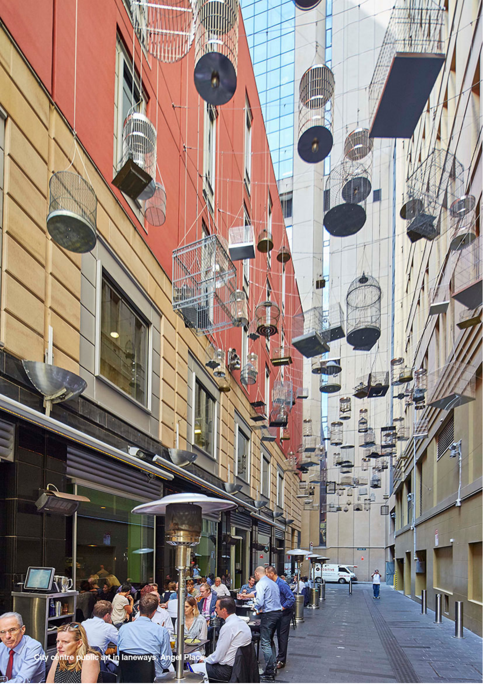
City centre public art in laneways, Angel Place