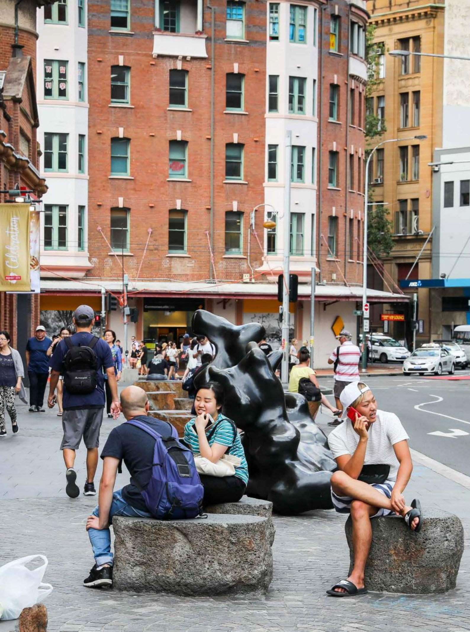
Chinatown, Thomas Street, Haymarket