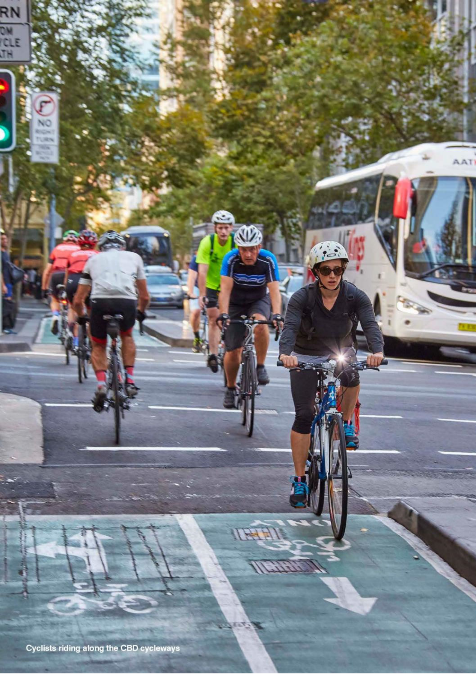
Cyclists riding along the CBD cycleways