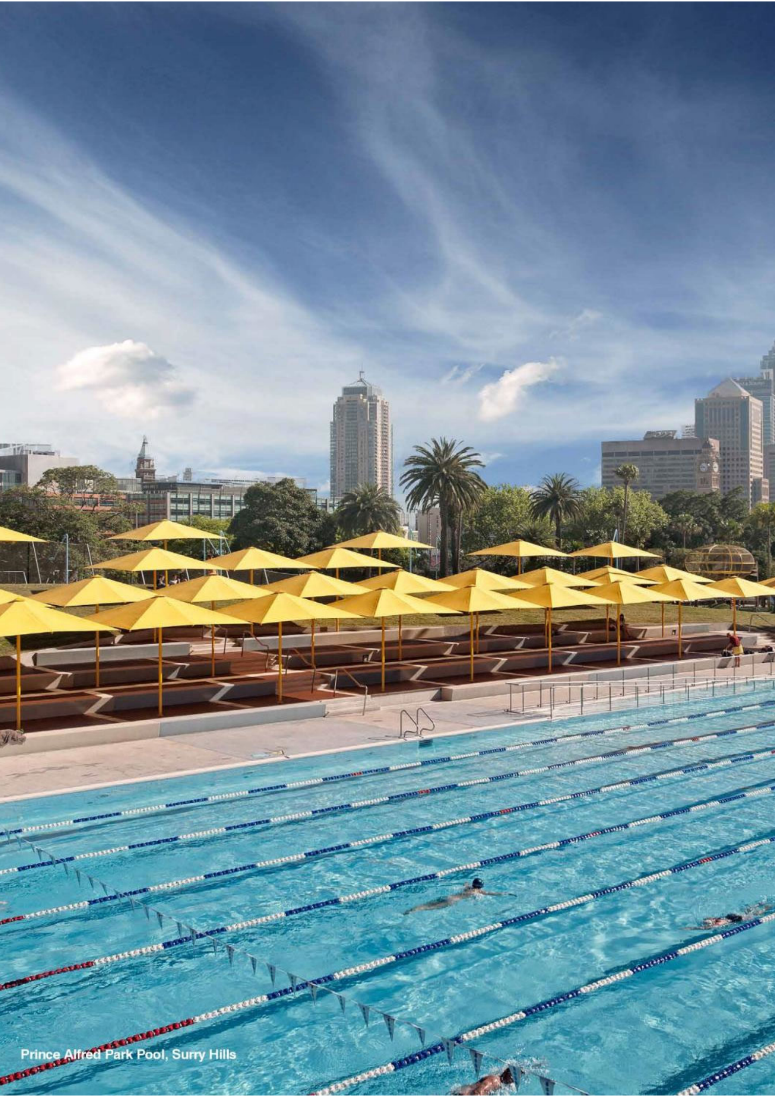
Prince Alfred Park Pool, Surry Hills