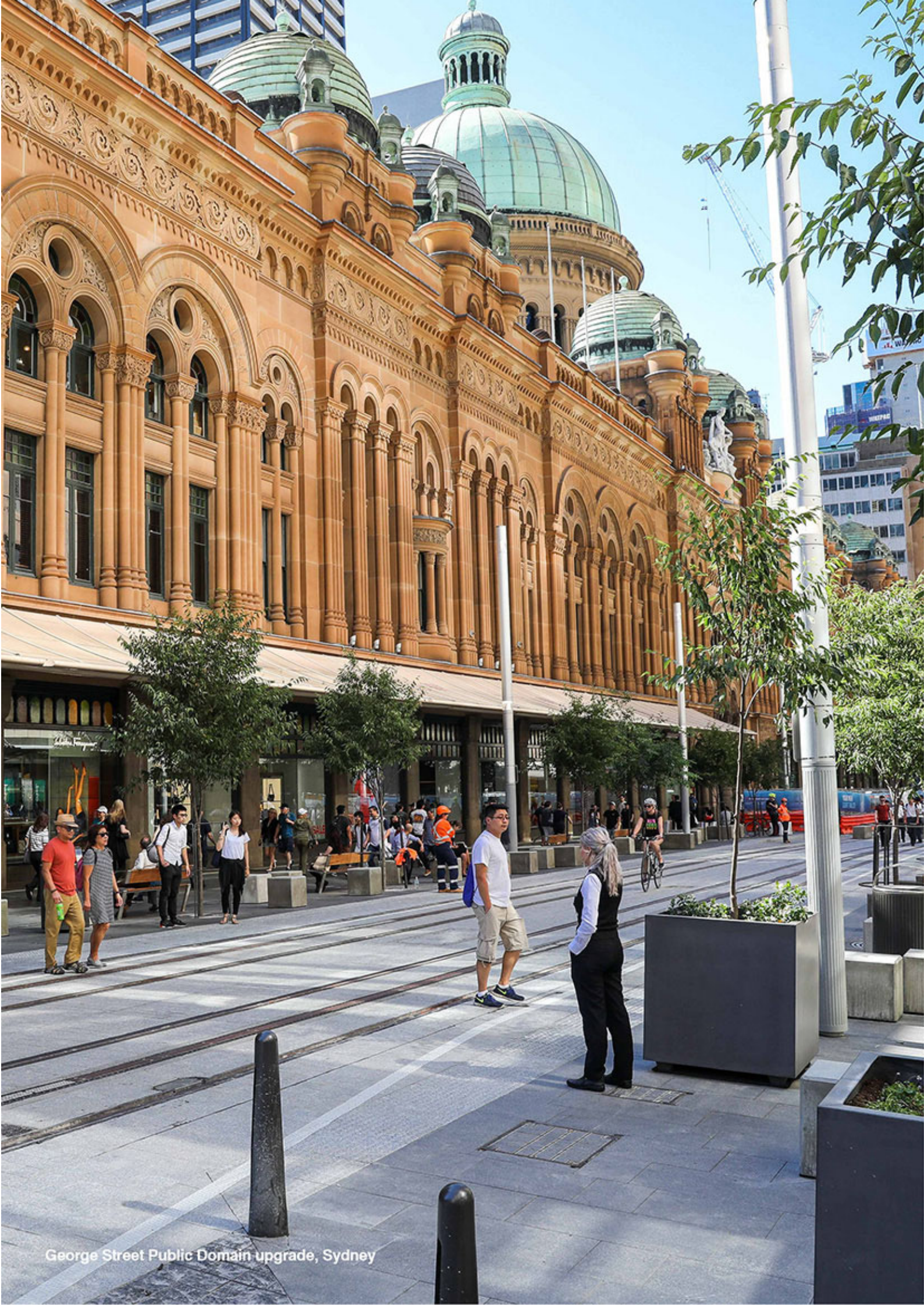
George Street Public Domain upgrade, Sydney