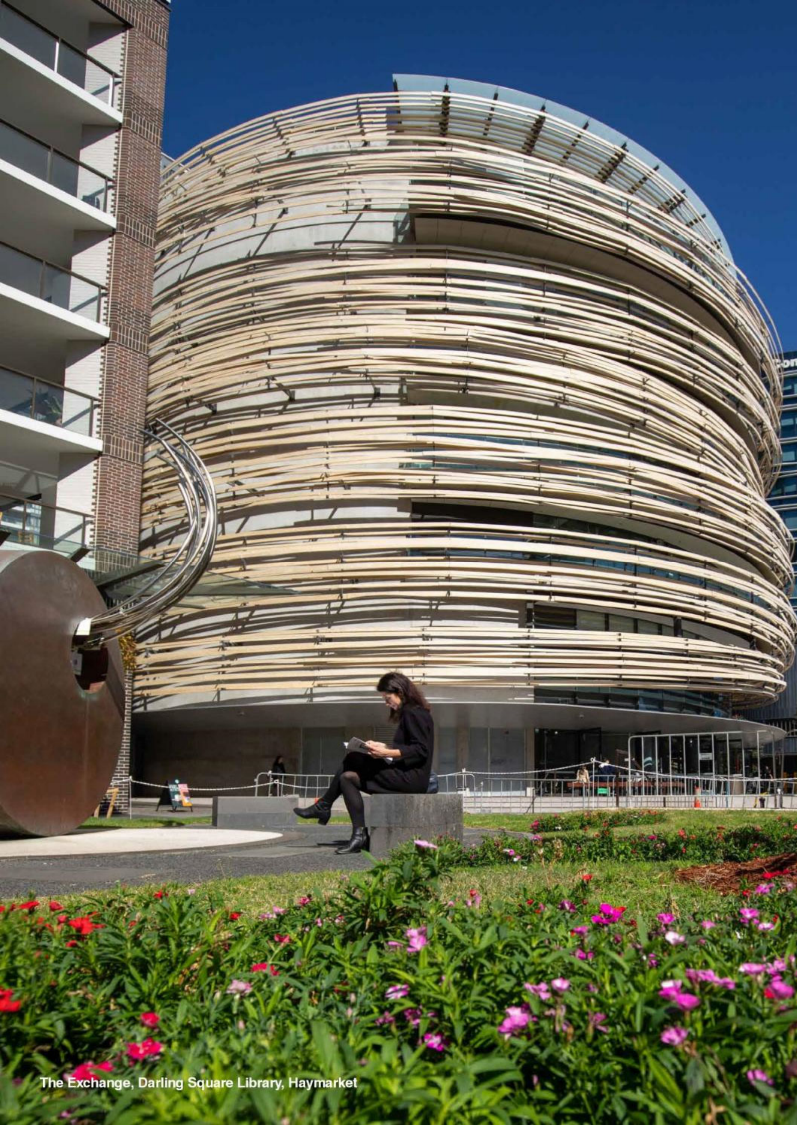
The Exchange, Darling Square Library, Haymarket