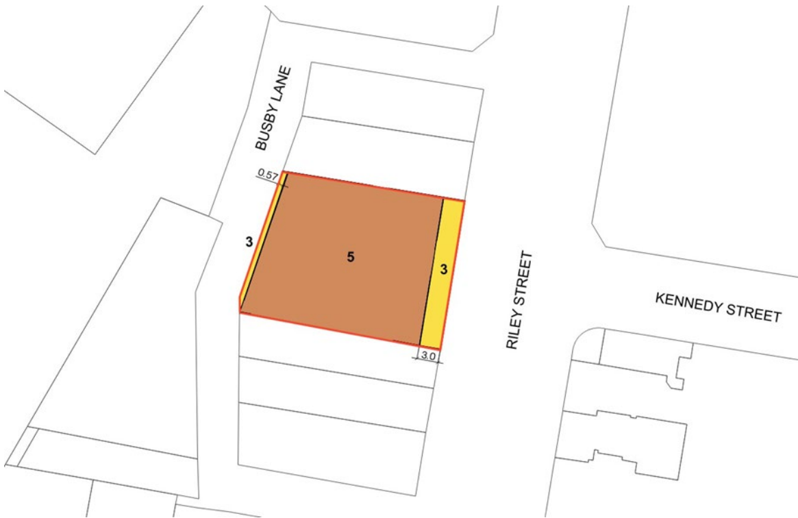
Figure 6.X Height of Building in Storeys and Upper Level Setbacks (setbacks are dimensioned in metres)