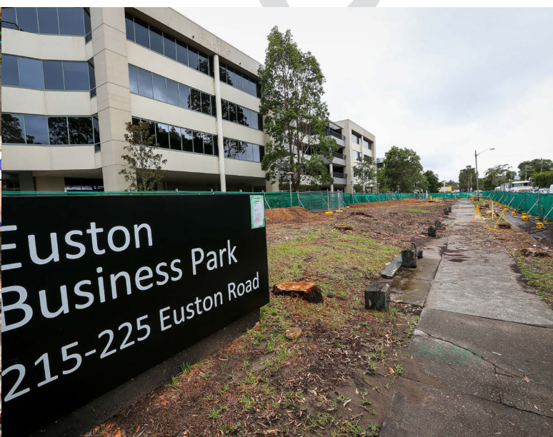
Above Euston Road before and after WestConnex road-widening

With stage two only about 30% complete, and the third stage still in planning, the Government needs to press pause now. There are too many threats to communities across Sydney, too many taxpayer funded billions at stake and too many flaws in their current proposal for it to be allowed to continue without fundamental changes.