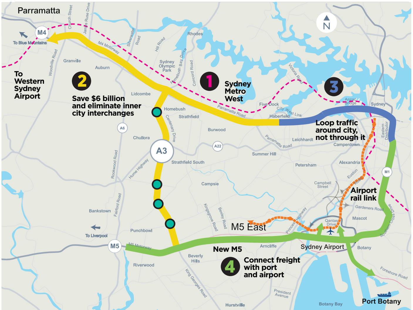
Above The City's alternative proposal to Stage 3