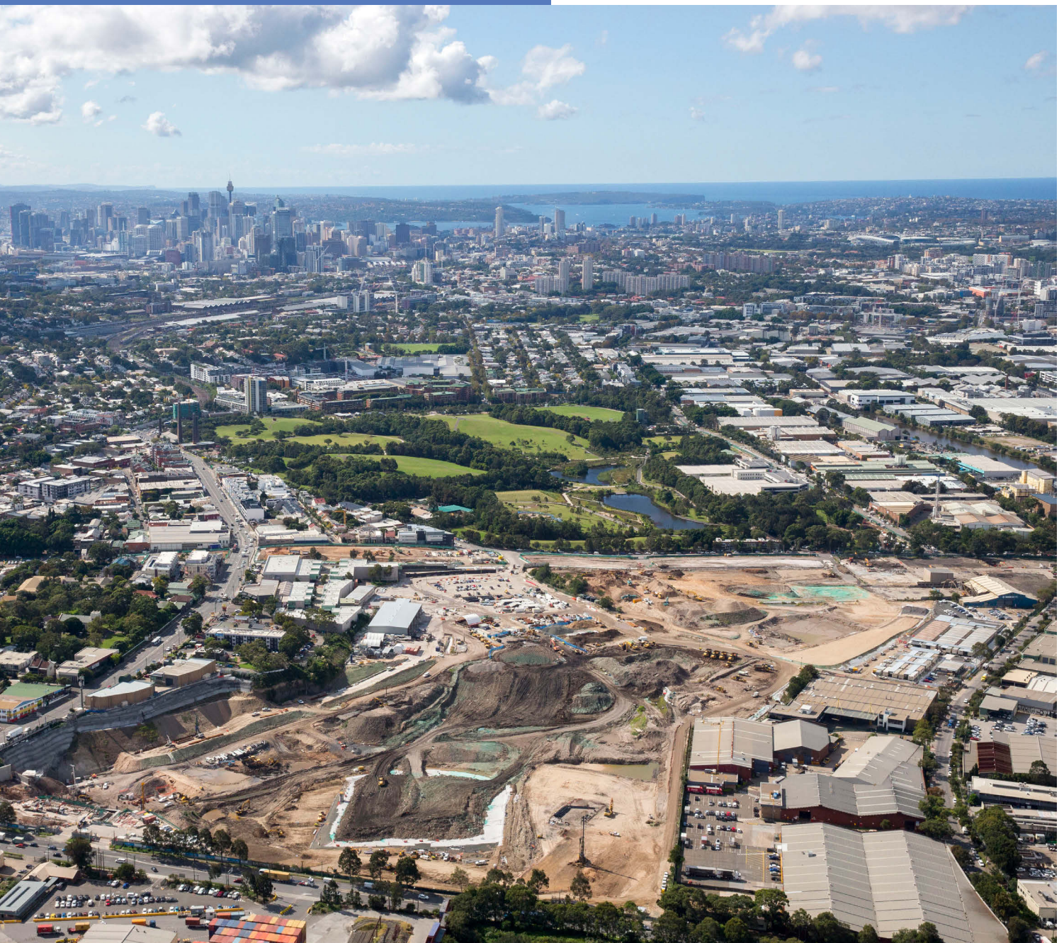
Above WestConnex St Peters Interchange under construction