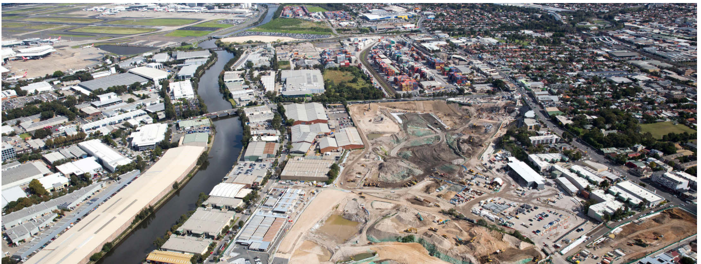
Above WestConnex motorway construction