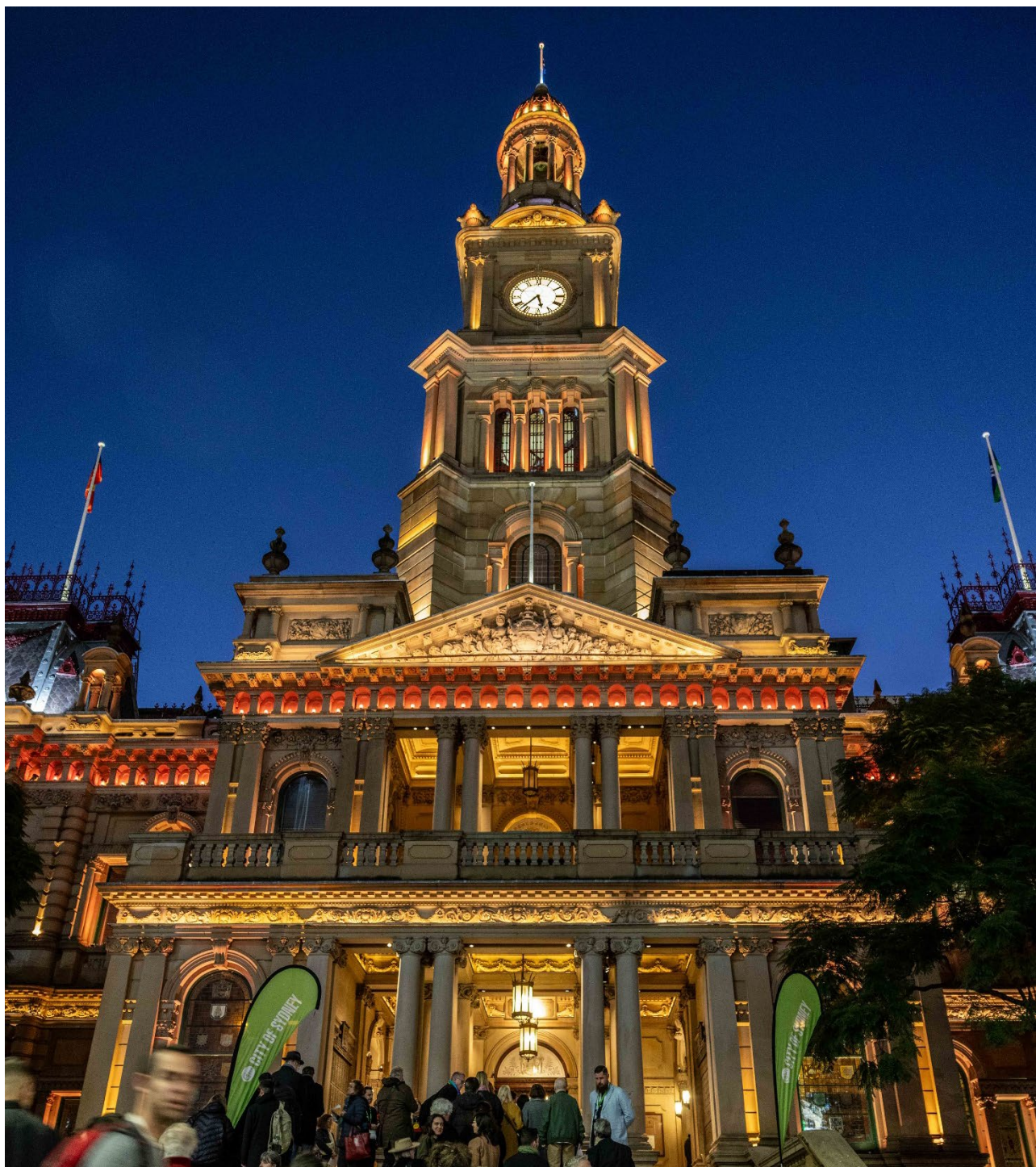
Figure 7. Sydney Town Hall Sydney