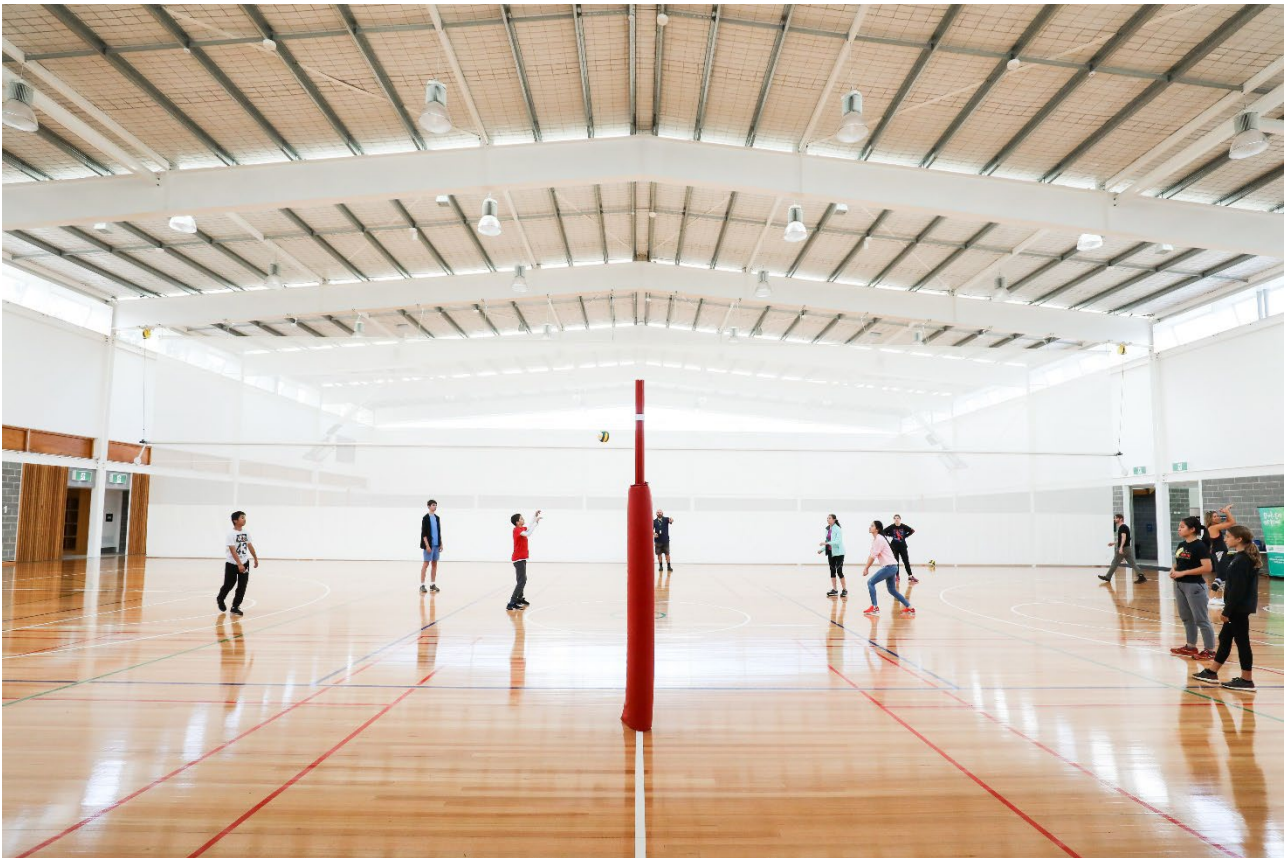
Figure 3. Indoor play at Perry Park Recreation Centre, Alexandria

Junior: children under eighteen (18) years of age.