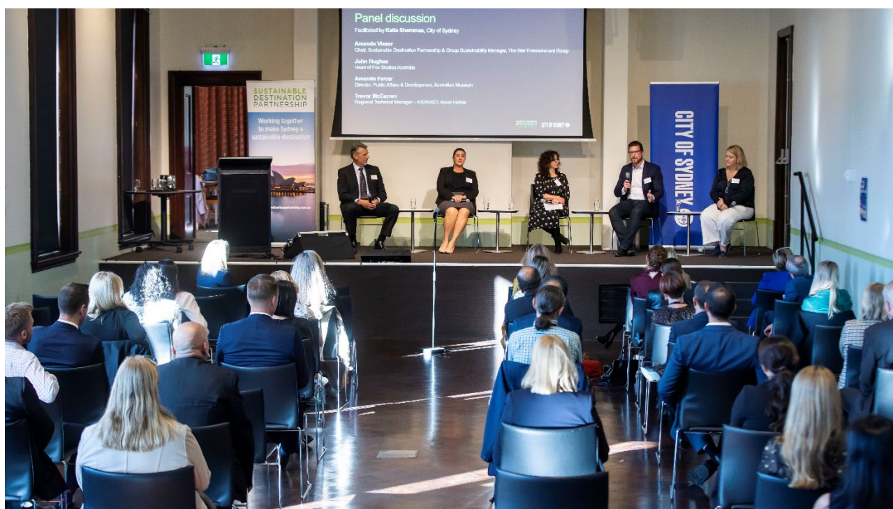
Figure 4. Barnet Long Room, Customs House at Circular Quay

2 Hiring of the Vestibule is at the discretion of the City and does not include access to Centennial Hall.