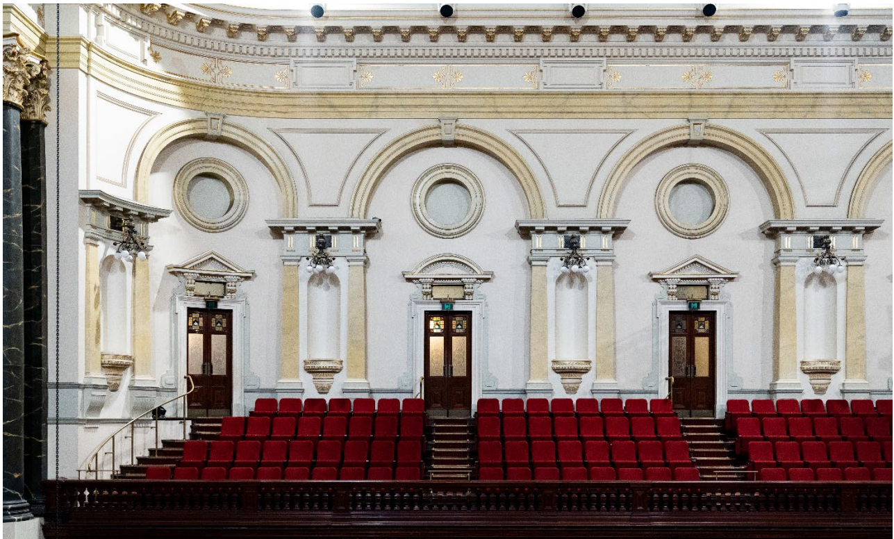
Figure 6. Lower Town Hall, Sydney