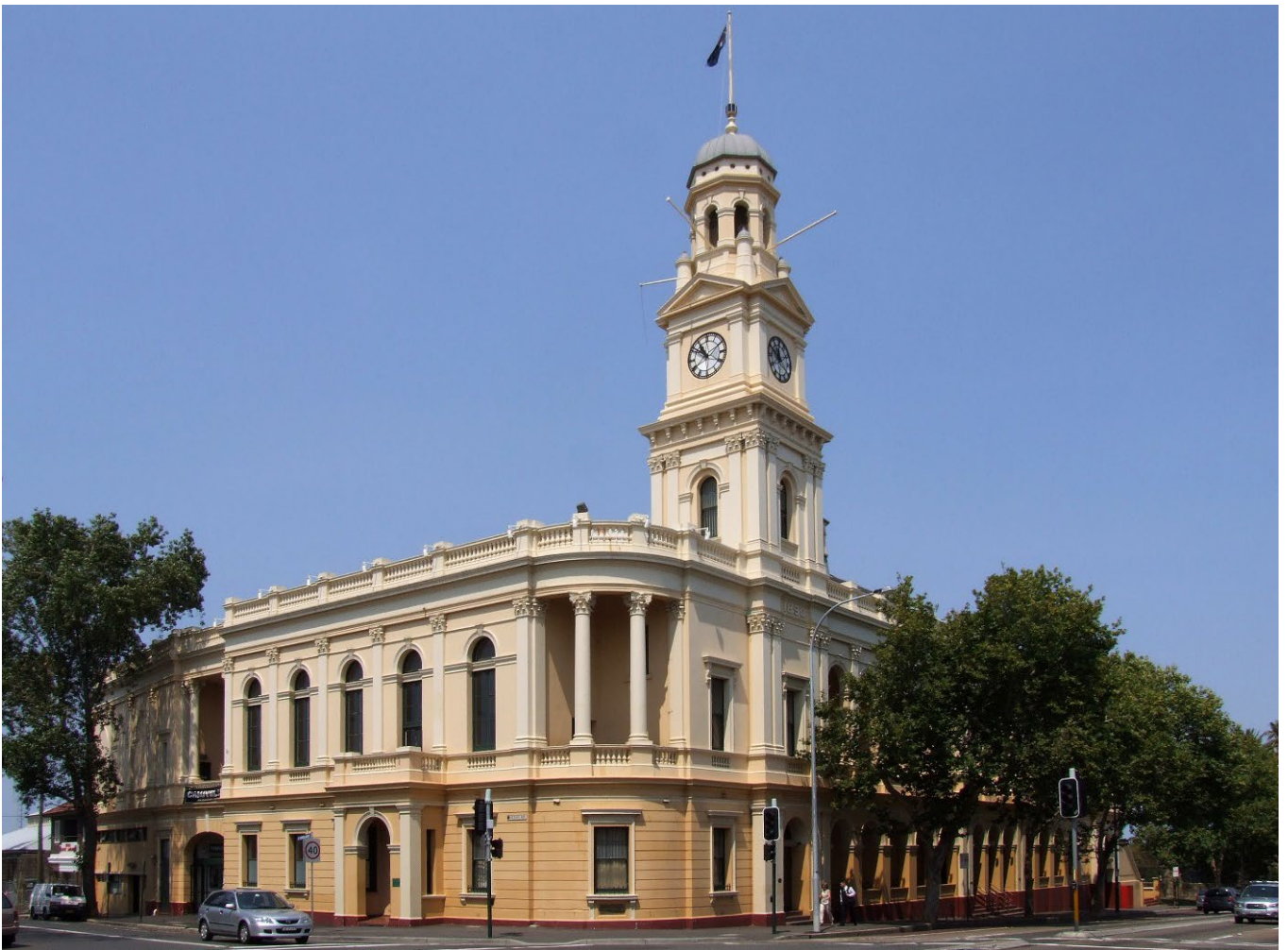
Figure 1. Paddington Town Hall Fees and Charges Appendix 1 – 2

These venues are managed by the City's Venue Management business unit. This document outlines the fees and charges for these landmark venues.