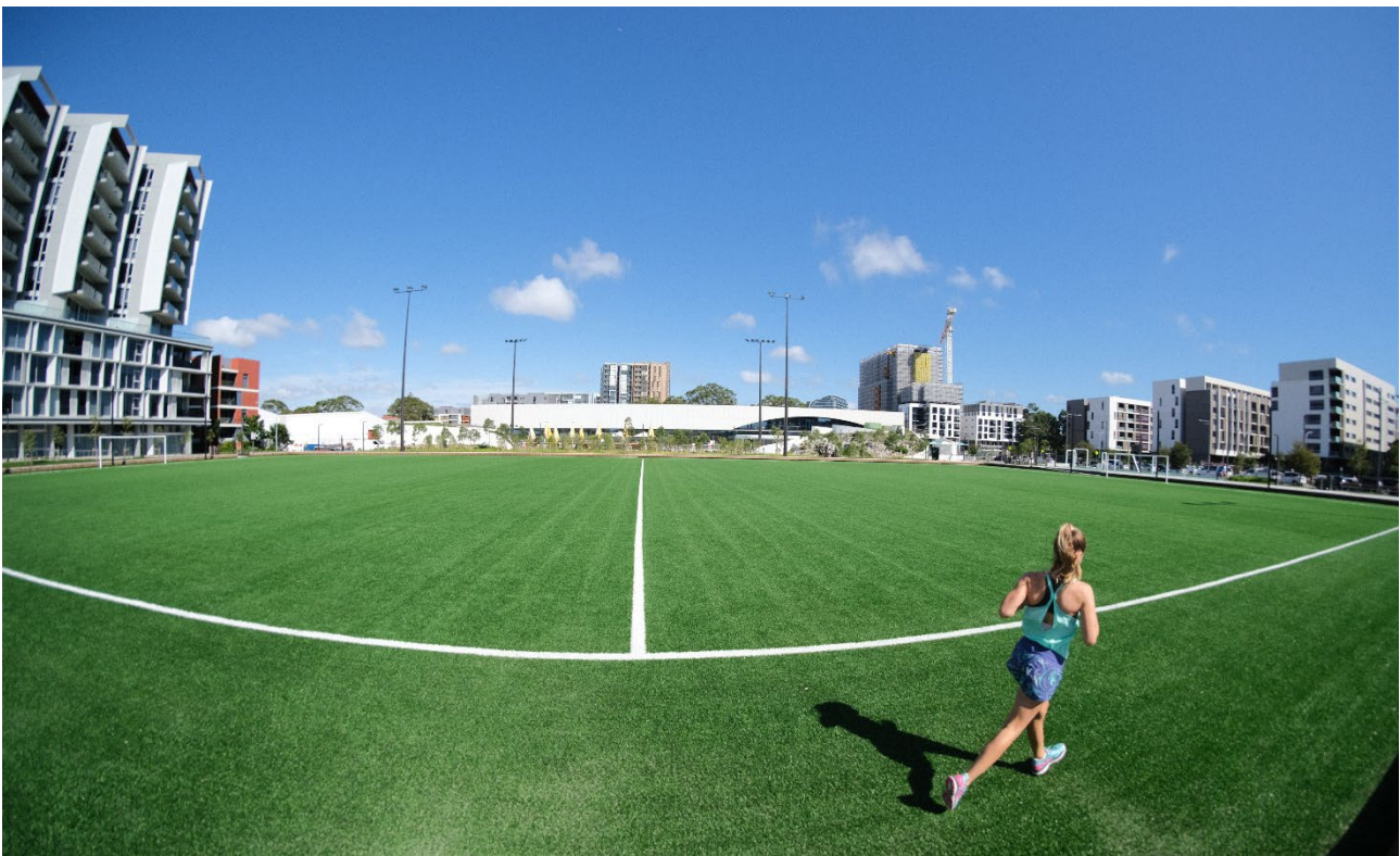
Figure 4. Gunyama Park synthetic sportsfield, Zetland

Bookings must be made through the City's Venue Management unit, via (02) 9265 9333 or via openspacebookings@cityofsydney.nsw.gov.au .