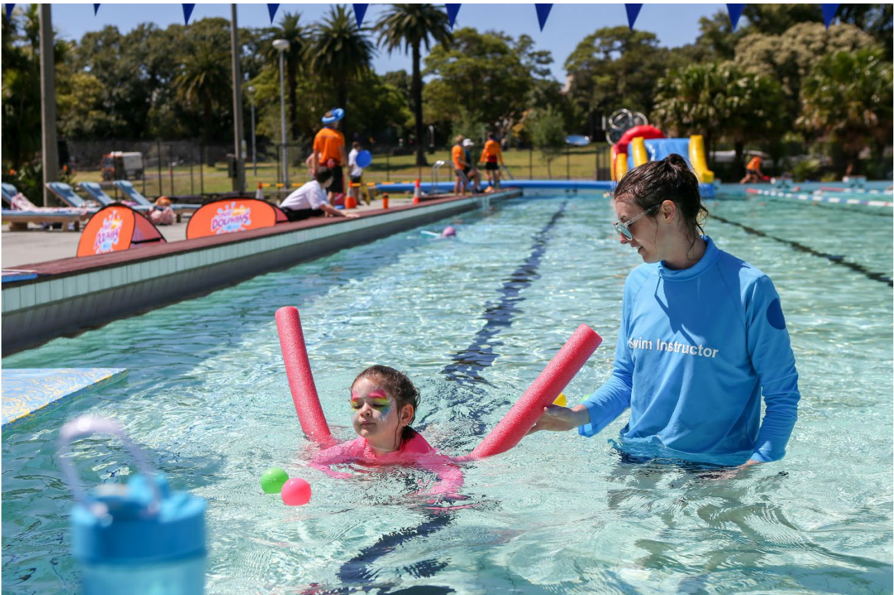
Figure 1. Swimming lesson, Victoria Park Pool, Camperdown

All lessons are charged by direct debit or up-front payment options only.