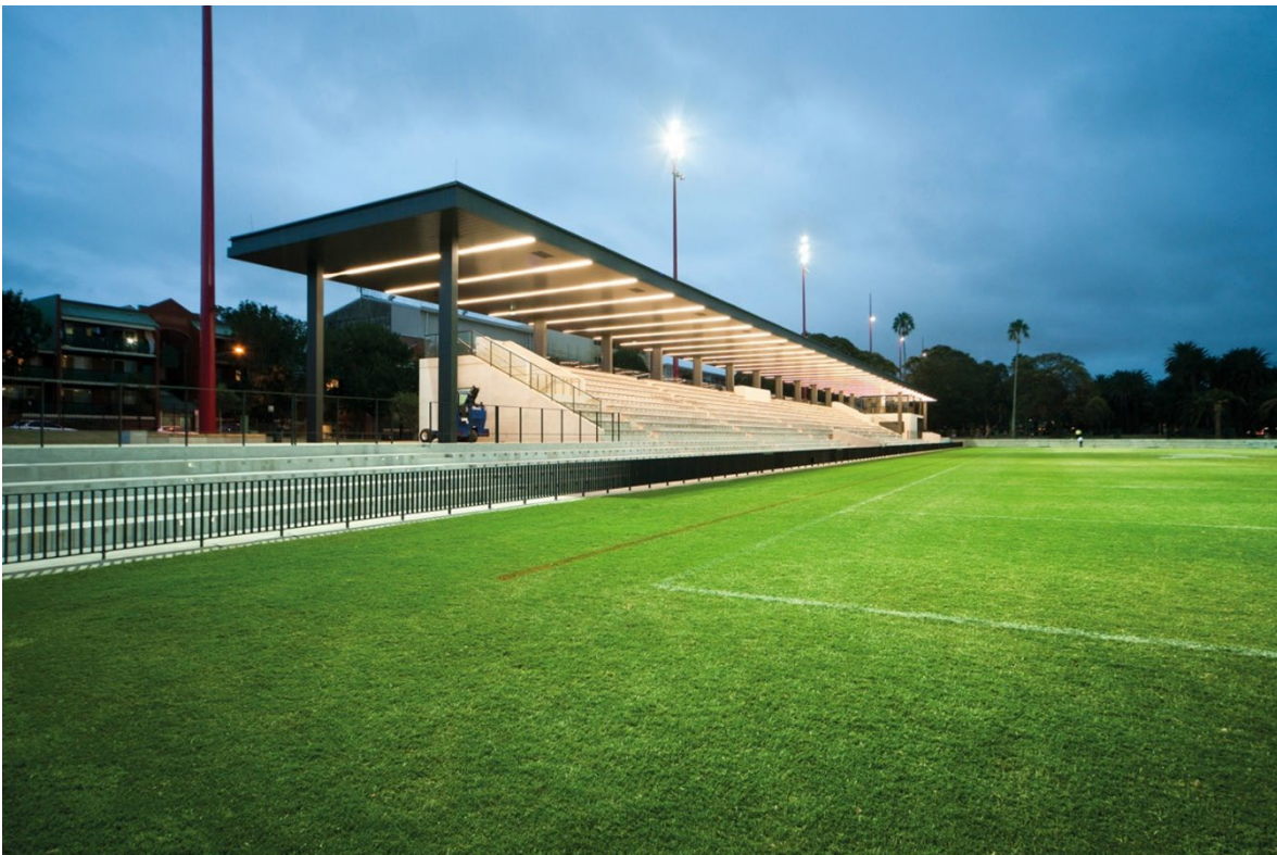
Figure 2. Redfern Oval