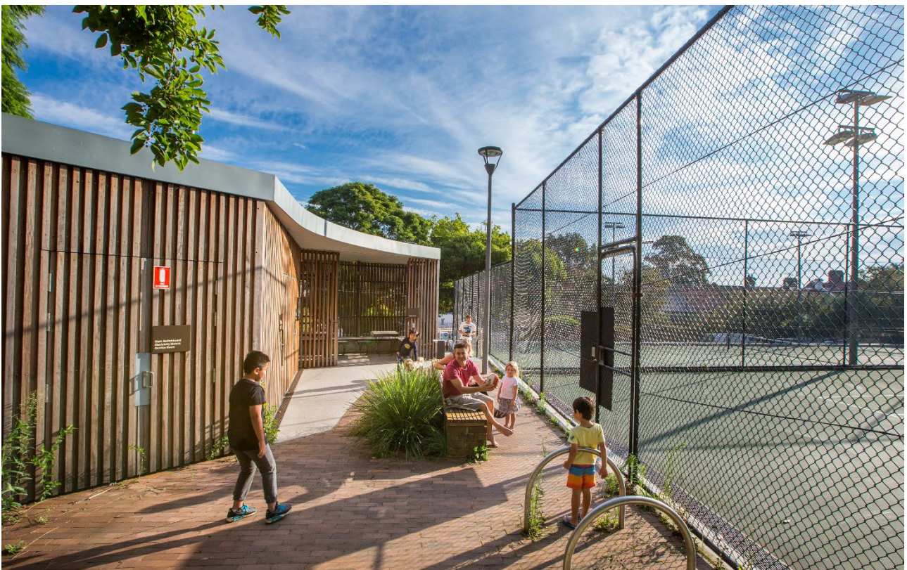
Figure 2. St James Park Tennis Courts, Glebe