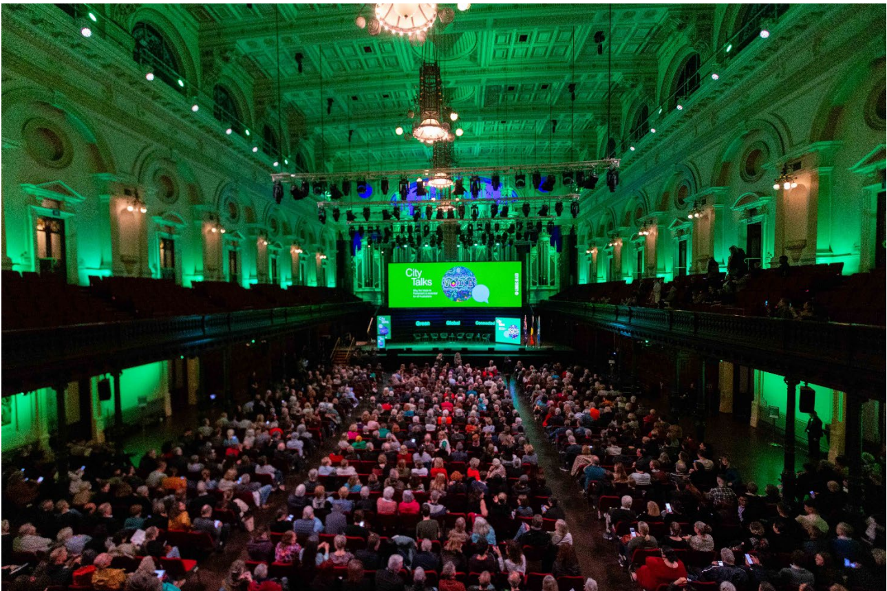
Figure 3. Centennial Hall, Sydney Town Hall

3 Where the venue is hired over a period of multiple days, and not used on any particular day in that period, the dark day hire rate will apply