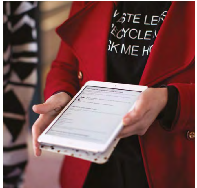
City of Sydney information sessions for communities in various formats.