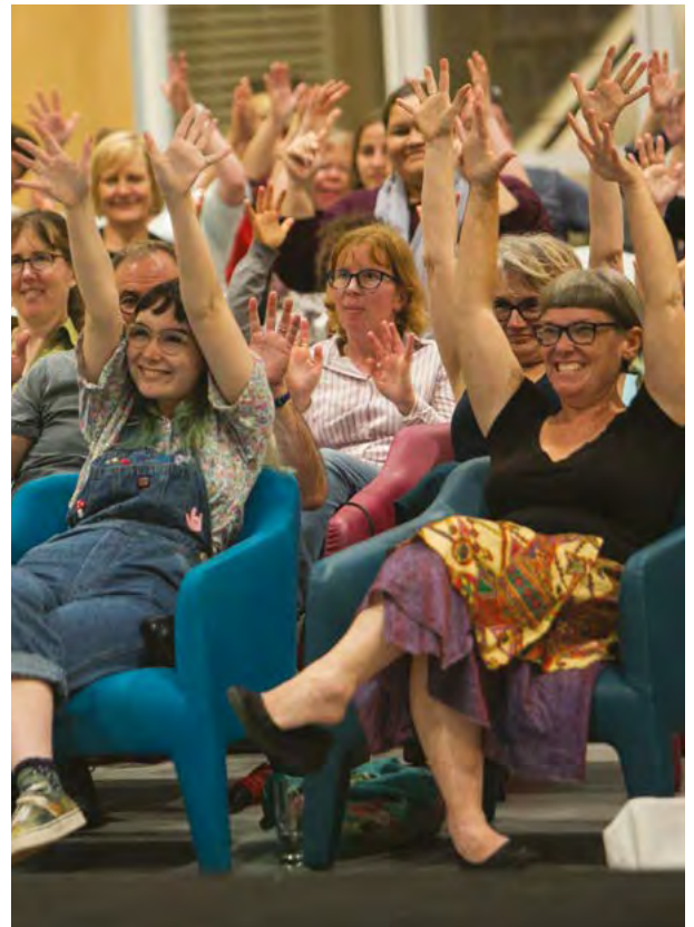
Auslan Poetry Slam audience applauds.

The Deaf community has a shared language and culture and a long tradition of common experience. Members of this community are mostly those people who were born deaf or became deaf early in life. Members may also include hearing friends, family members and those who work with Deaf people, such as interpreters and community workers. What particularly links individuals and groups and makes them a distinct community is their shared use of Auslan (Australian Sign Language).