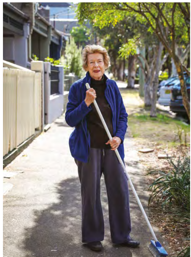
Local residents want to live, learn, work and play.

Responding to our wellbeing survey, City of Sydney residents identifying as a person with disability mentioned difficulties accessing: venues (31 per cent), transport (20 per cent) and barriers to communication (16 per cent) more than twice as often as others when prompted for barriers limiting participation in the community and cultural activities in the past month. Similar to the rest of the community, cost of activities (60 per cent), shortage of suitable programs (44 per cent) and difficulty finding information (37 per cent) were issues for many. 33