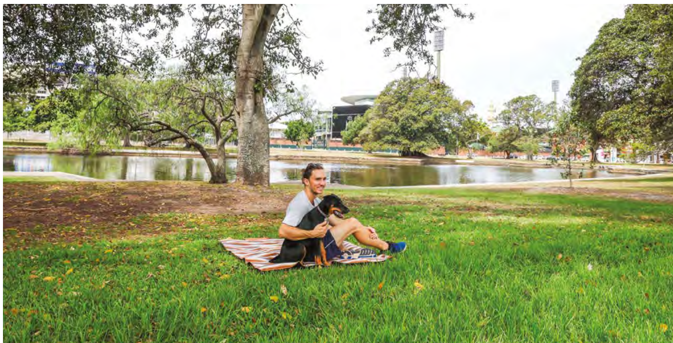
Time out in Moore Park.