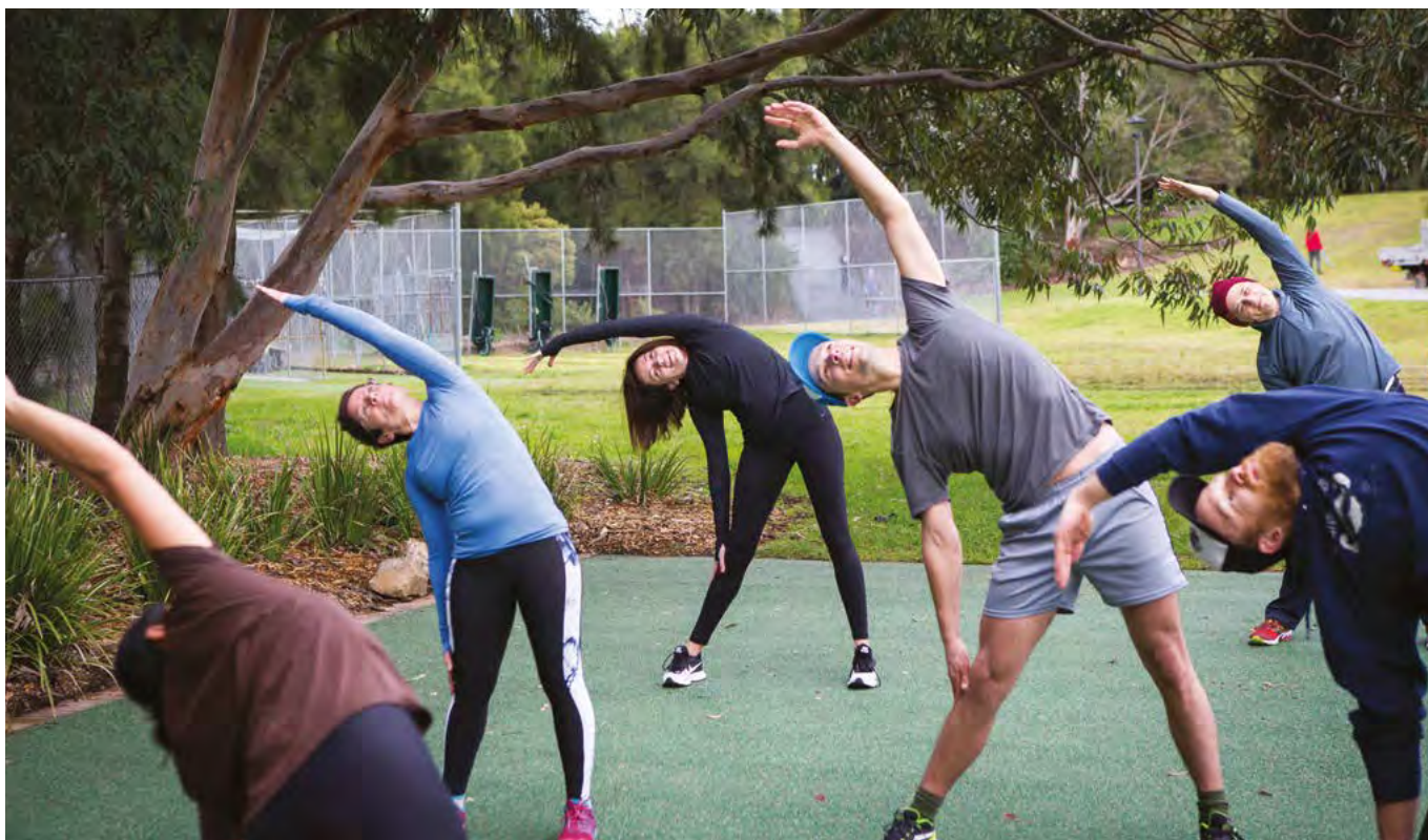
Group fitness at Sydney Park.