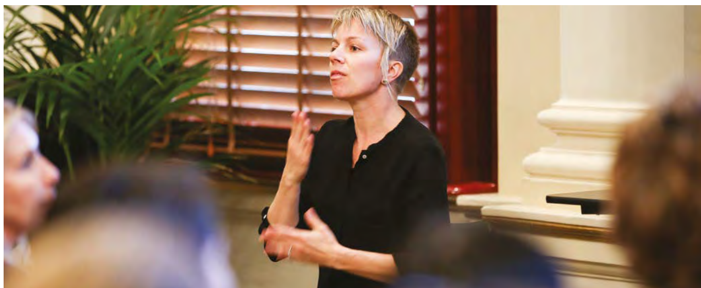
A woman speaks in Auslan to a group.