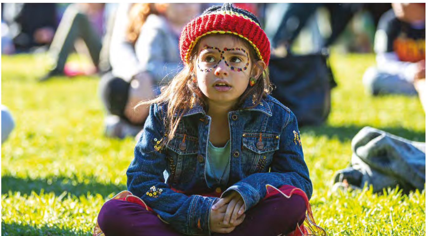
NAIDOC in the City 2019.

Sustainable Sydney 2030 recognises Sydney's Aboriginal heritage and contemporary Aboriginal and Torres Strait Islander cultures. Aboriginal and Torres Strait Islander communities in the City were extensively consulted for Sustainable Sydney 2030 and this consultation continues today. The City of Sydney is committed to acknowledging, sharing and celebrating a living culture in the heart of our city.