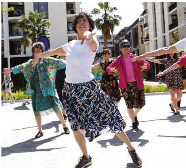
A group of older Asian women are performing Tai Chi with arms stretched out in a community square.

Over half of our residents are born overseas and 41 per cent speak a language other than English at home. This is reflected in the number of people living with disabilities – over 2,100 (or 42 per cent) of the City area residents who need assistance with core activities speak a language other than English at home. 28