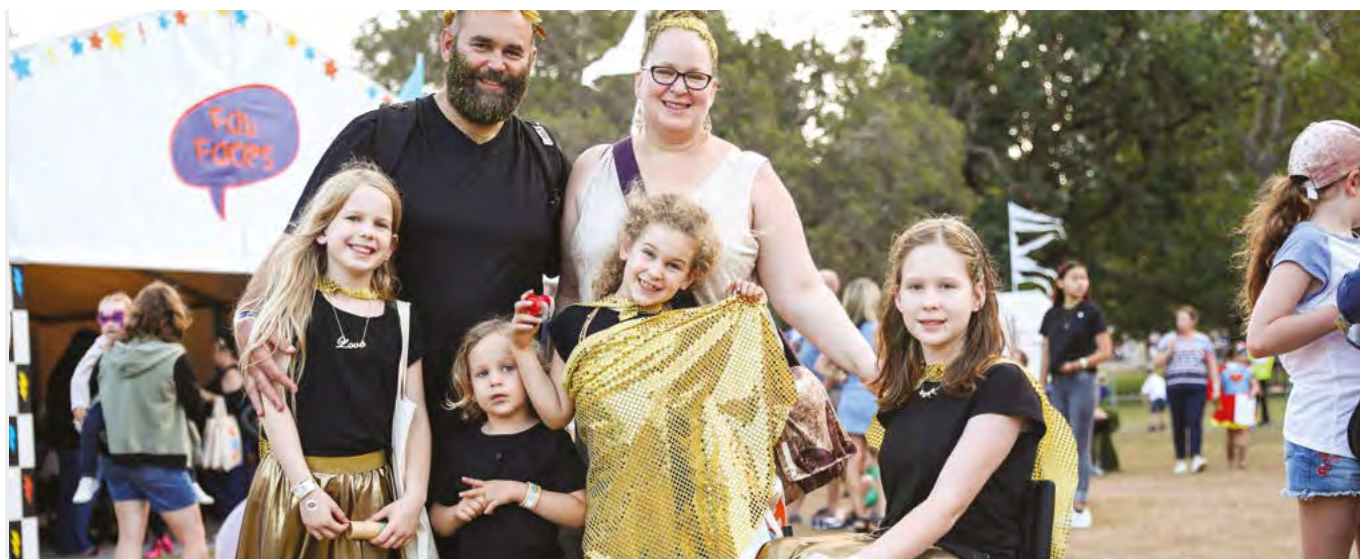
Lord Mayors' Picnic held at the Royal Botanic Garden Sydney on New Year's Eve.