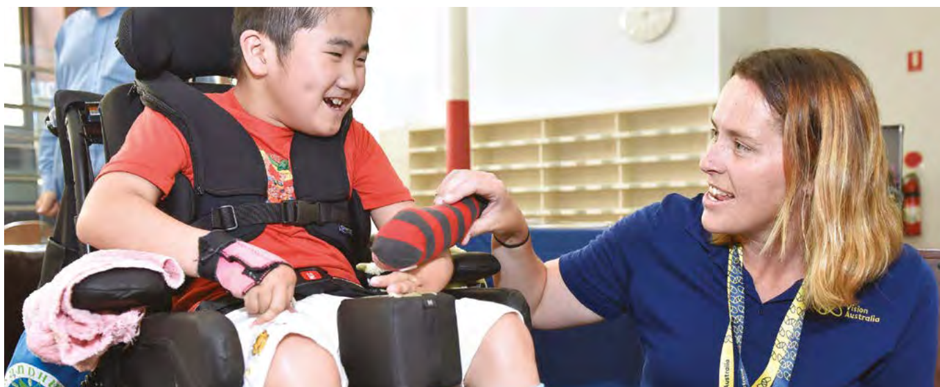
Sensory Feelix Storytime brings stories to life through braille, tactile books, objects and craft for children.