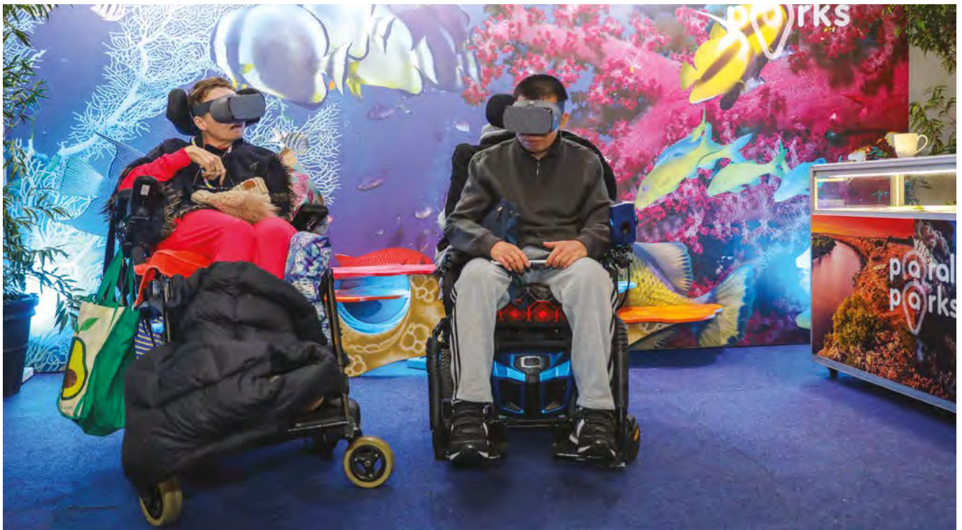
Virtual reality headsets allow people to explore the Great Barrier Reef at Customs House Library.