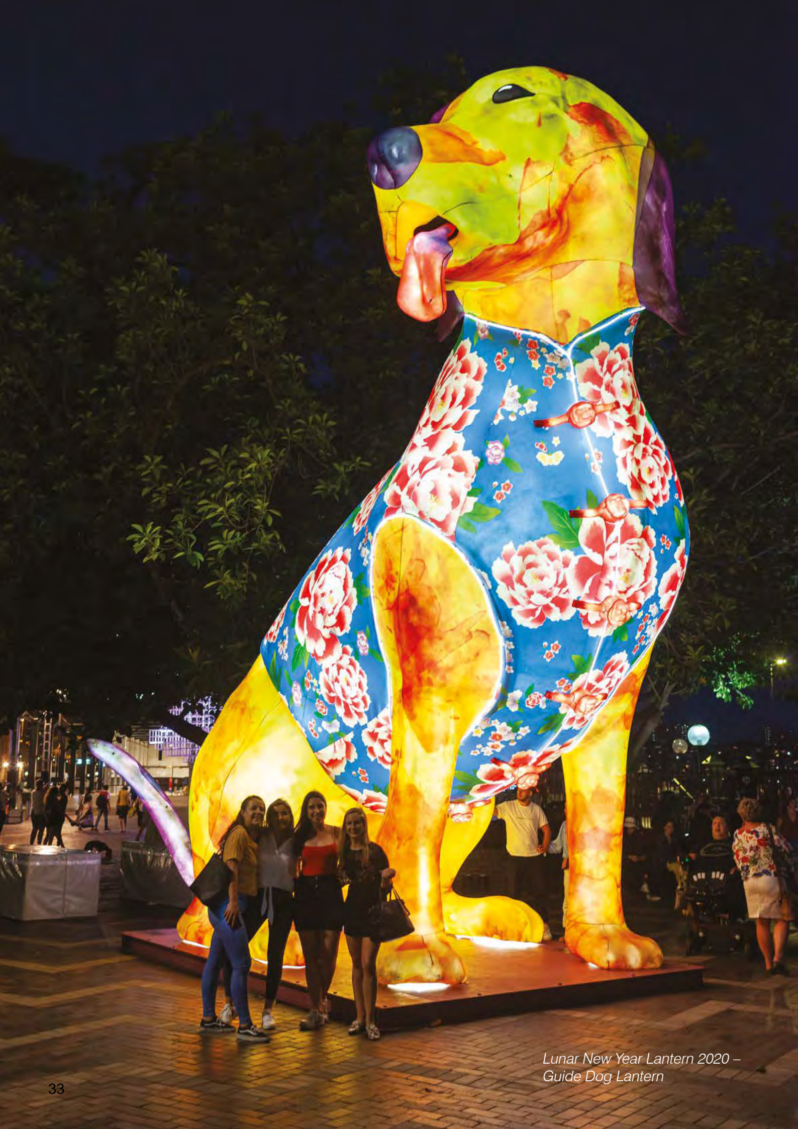
Lunar New Year Lantern 2020 – Guide Dog Lantern