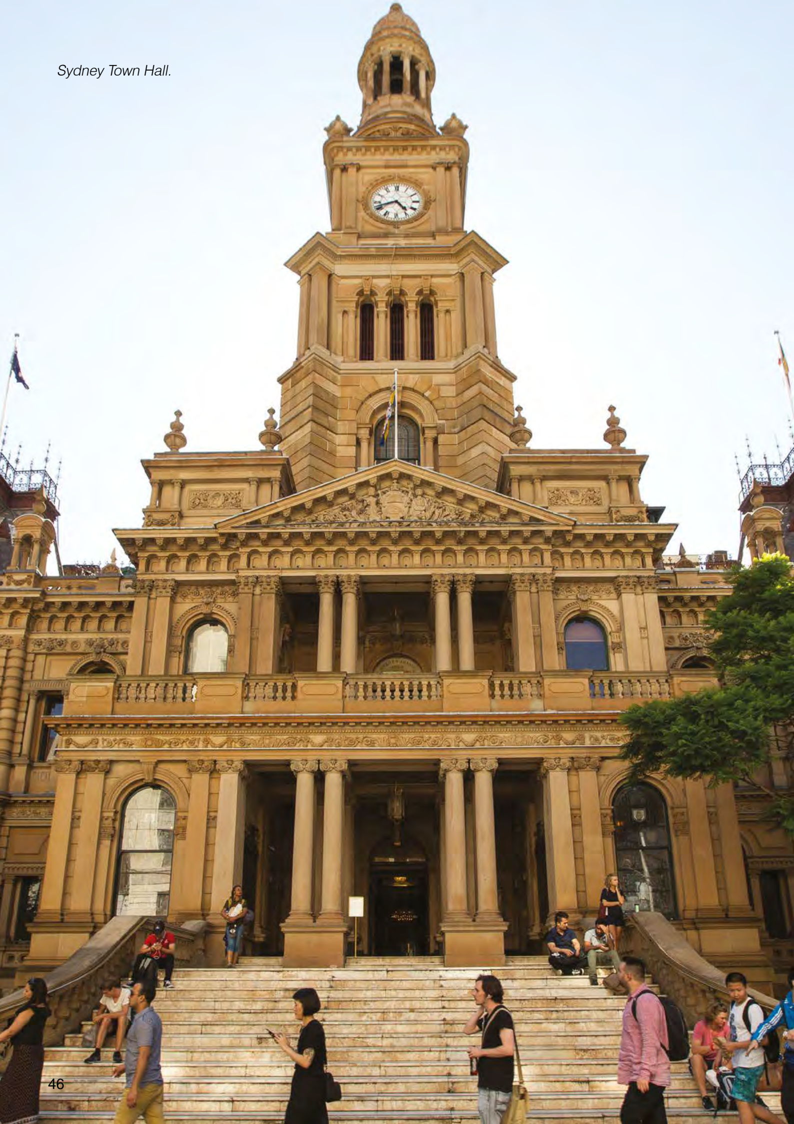
Sydney Town Hall.