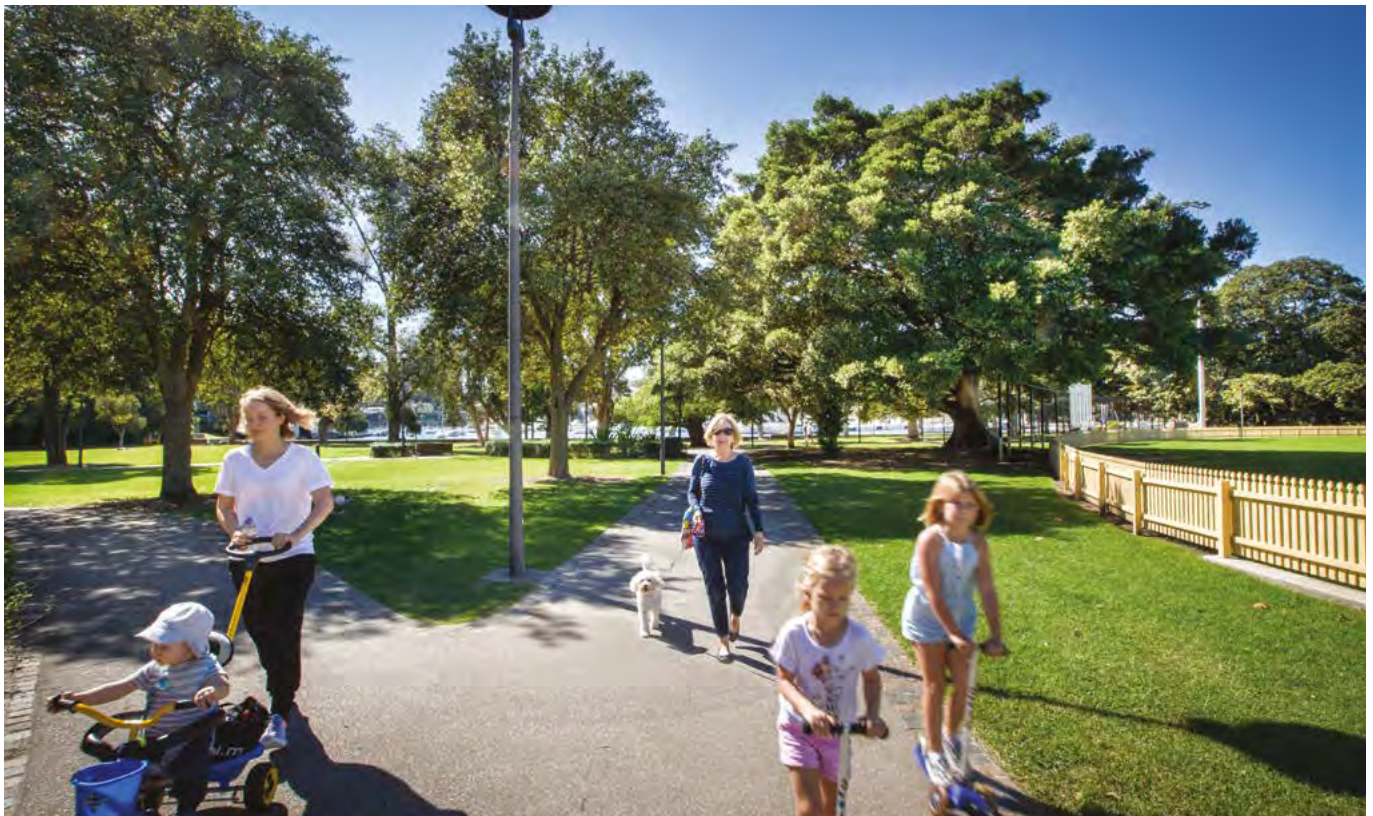
Green, global and connected at Rushcutters Bay Park.

In 2018, Council resolved to review this vision, engaging the community in the development of a revised plan that extends to 2050. We expect our Council will consider the 2050 vision in mid-2021 and this will inform our new community strategic plan in 2022.