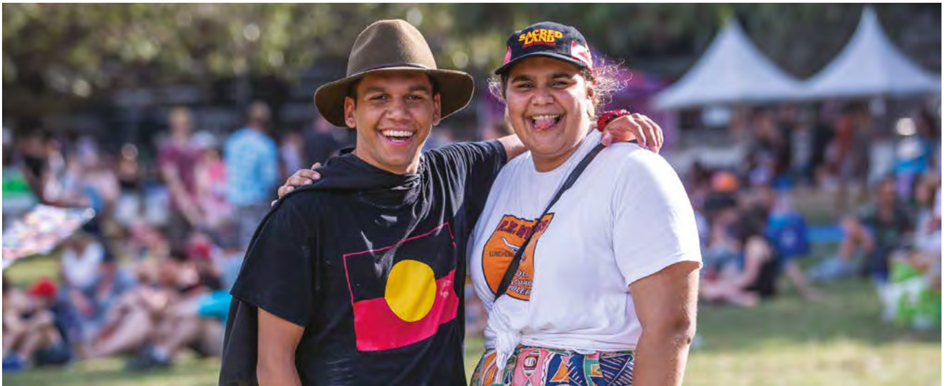
Yabun Festival celebrates Aboriginal and Torres Strait Islander cultures in Australia.