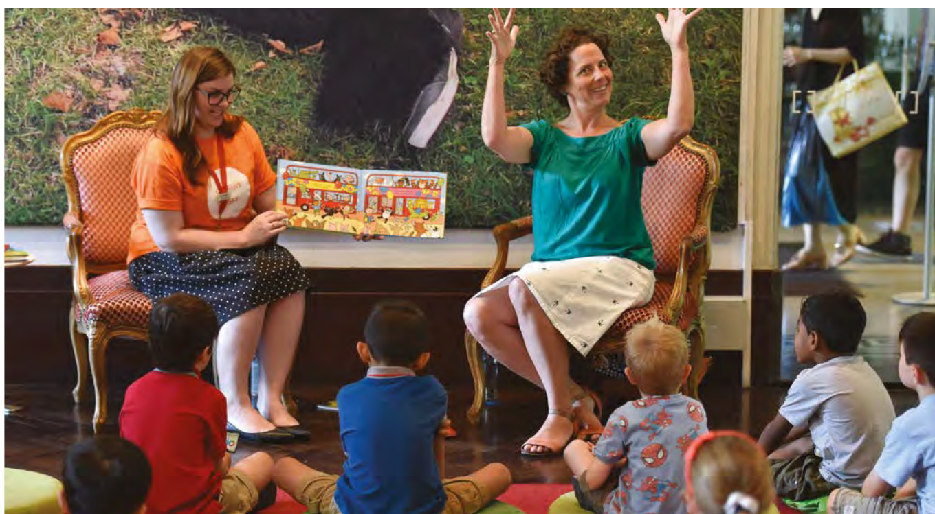
Auslan Storytime for pre-school age children.