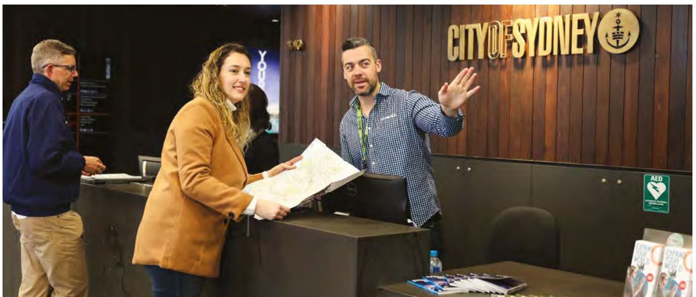
City of Sydney customer service centres provide many services to the community.