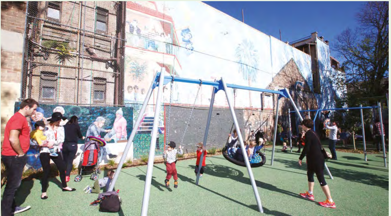
Inclusive bucket swing at Reconciliation Park, Redfern.