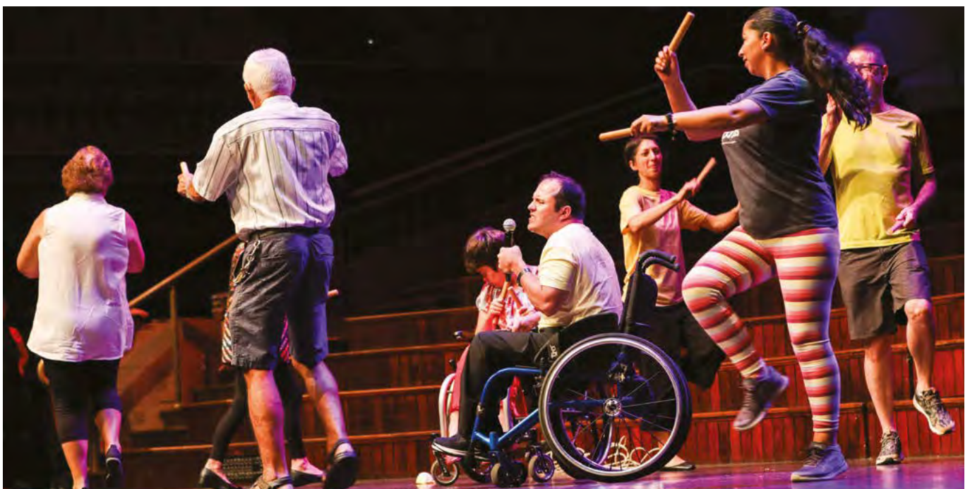
City community centres come together to host Community's Got Talent.

What these statistics reveal is that disability is part of the human experience; that if a person does not have disability now, chances are that at some point in their lives they will experience some form of disability, a lived experience of a mental health condition or be a carer.