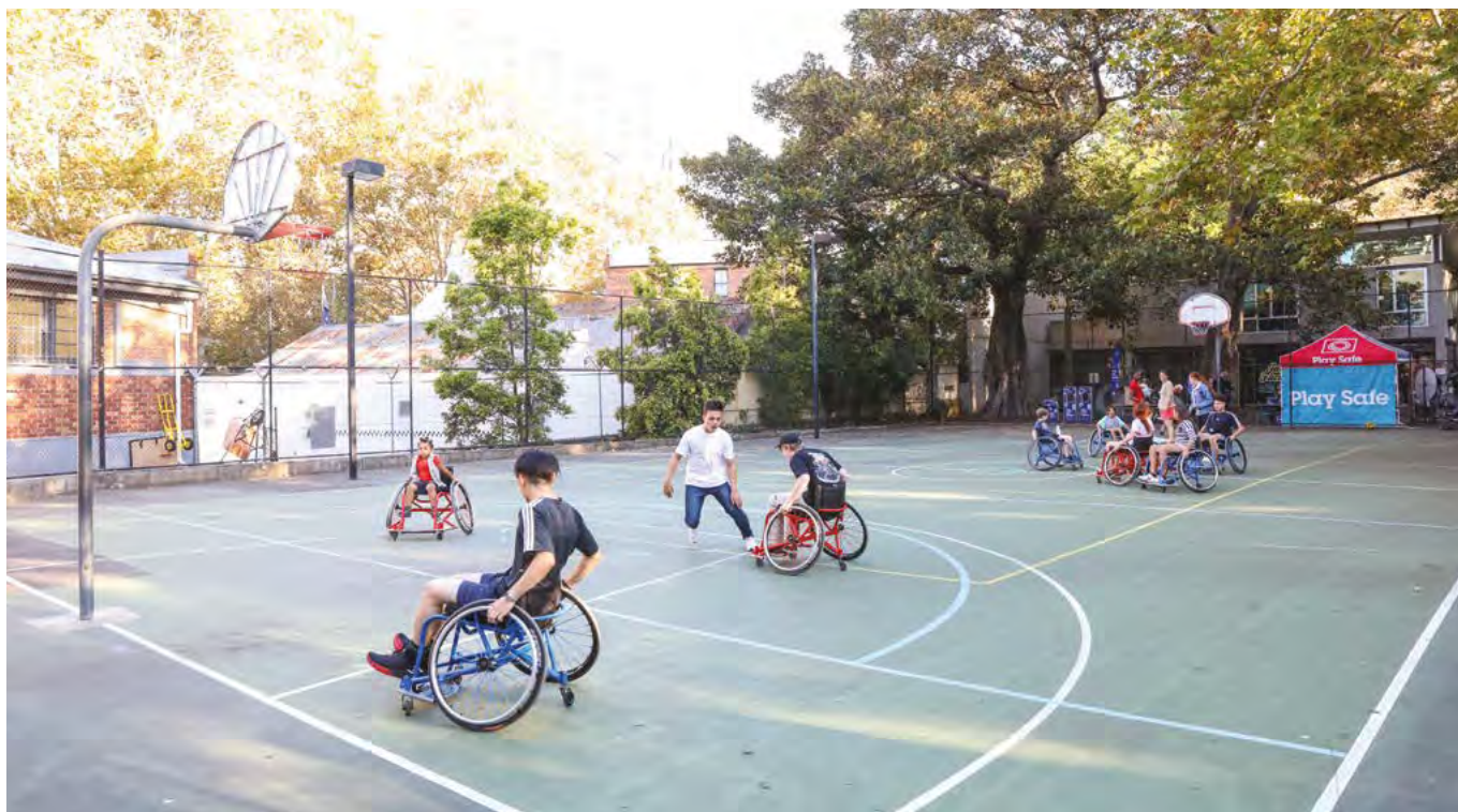
City of Sydney Youth Week 2019 wrap party at Yurong Parkway Basketball Courts.