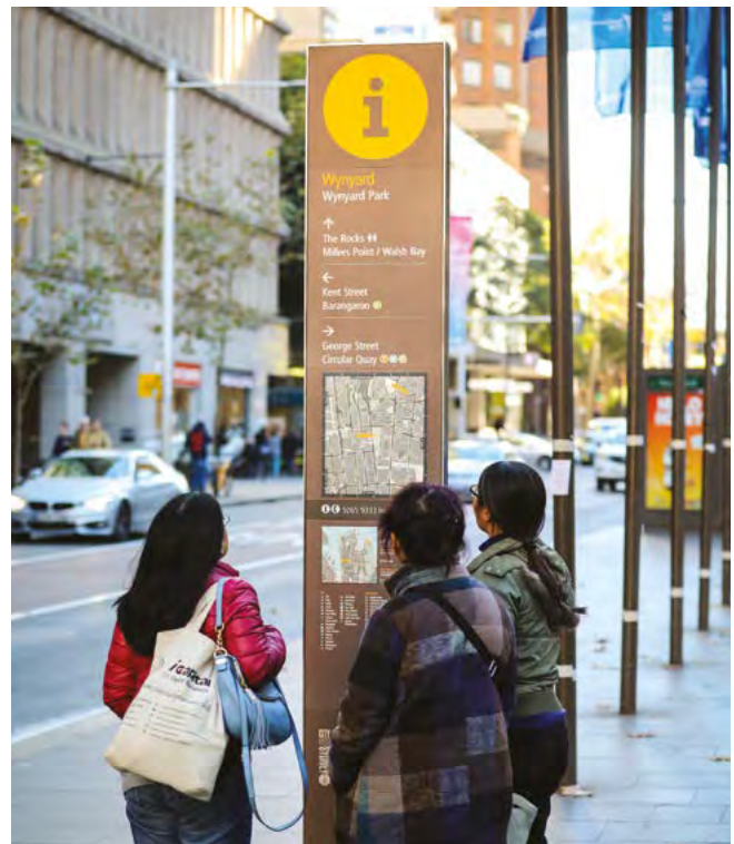
Wayfinding map at Wynyard.

Other issues raised included: improved access to lifts particularly in areas where there are barriers such as steps or challenging topography, more seating for people who cannot walk long distances to rest and accessible public toilets, including a need for more adult change facilities in key locations.