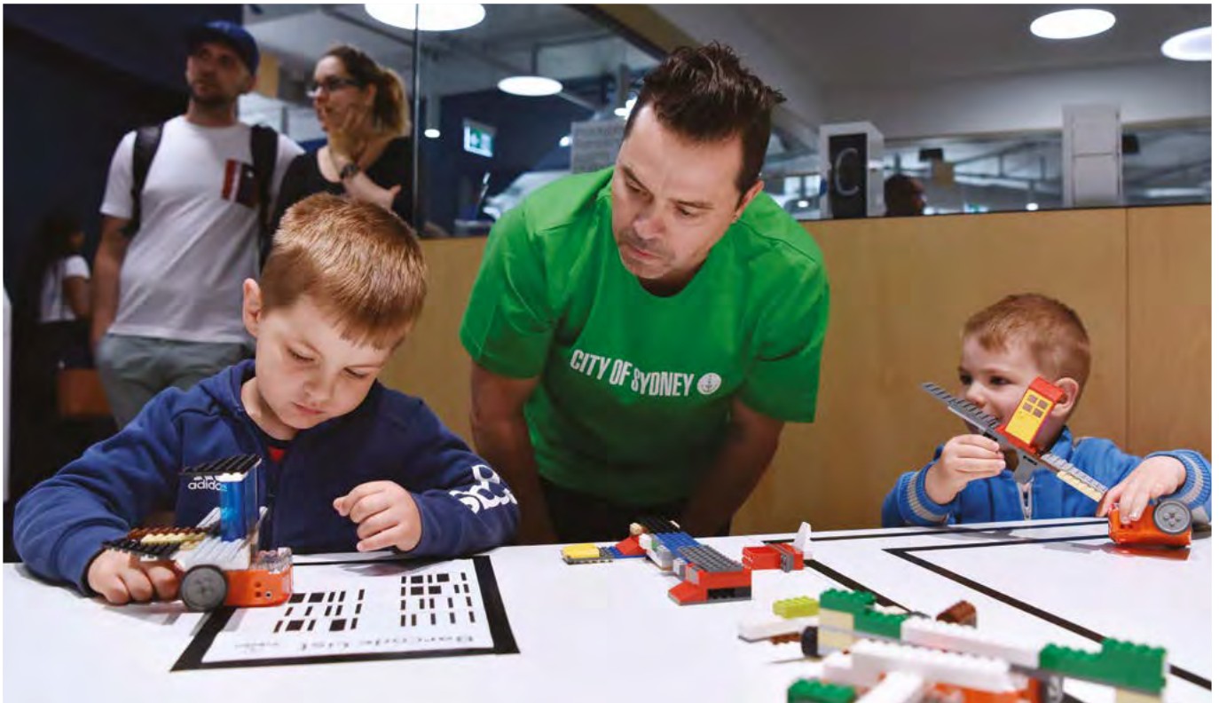
Darling Square Library Ideas Lab.