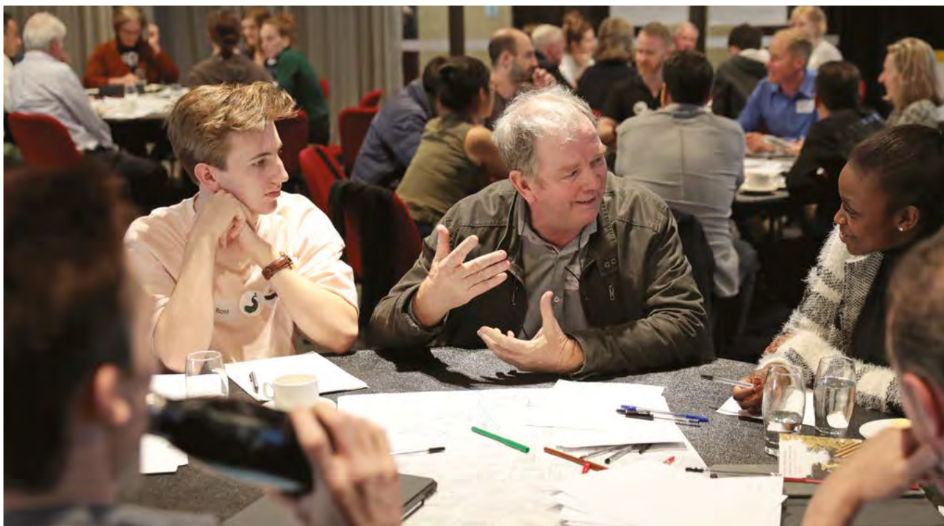
Consultation with people on Sydney 2050.