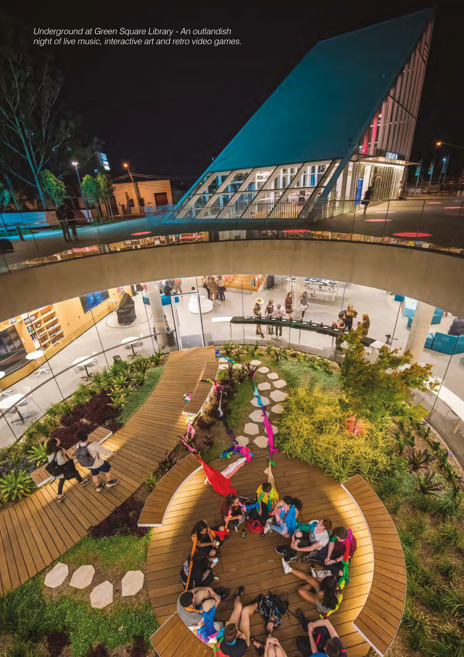
Underground at Green Square Library - An outlandish night of live music, interactive art and retro video games.