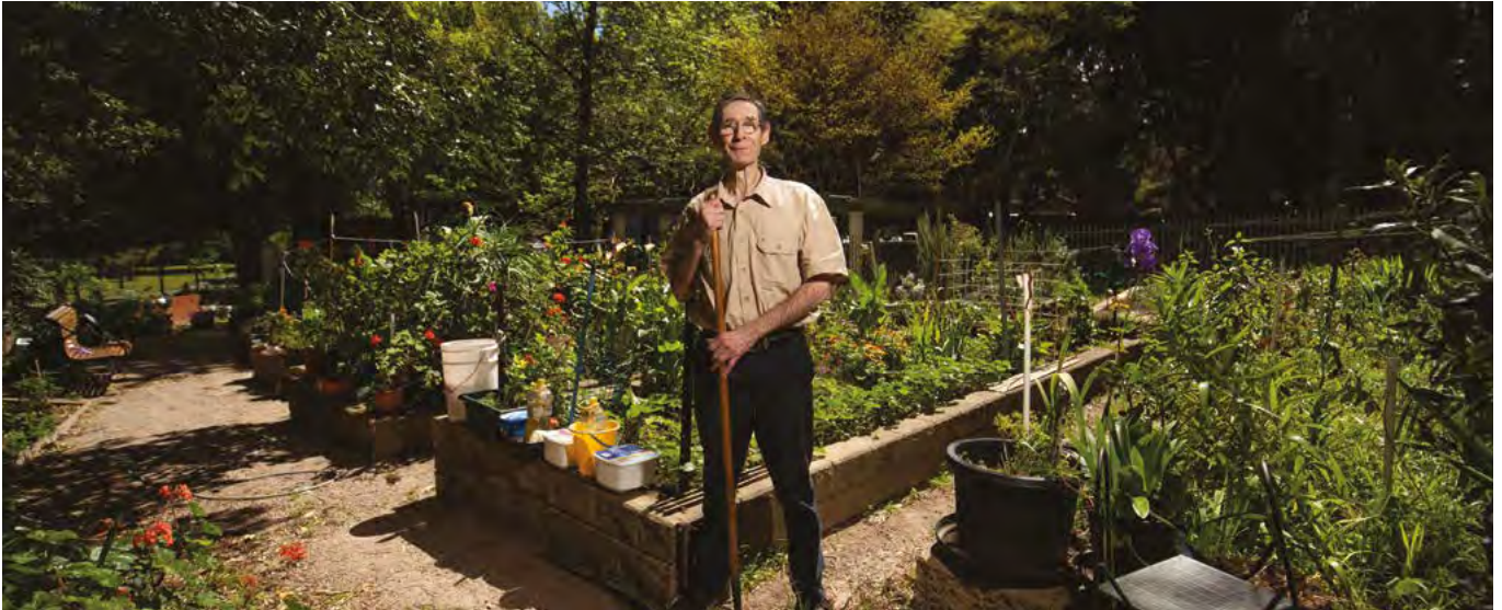
Waterloo Estate Community Garden promotes health and wellbeing.

One in five (20 per cent) or 4.8 million Australians and nearly 1.5 million NSW residents (19 per cent) had a current and long-term mental health condition in 2017–18, nearly double the rate recorded in 2007–08 (11 per cent). 17 22 per cent of City of Sydney residents reported ‘poor’ or ‘fair’ mental health outcomes in 2018, up from 14 per cent in 2015. The proportion was much higher among people who identified as a person with disability with 52 per cent rating their mental health as ‘poor’ or ‘fair’. 18