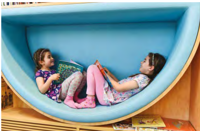
Green Square Library designed for all.

While it is important to identify specific actions to assist in the development of positive attitudes and behaviours, we know that actions under the other three strategic directions will also contribute to developing inclusive attitudes.