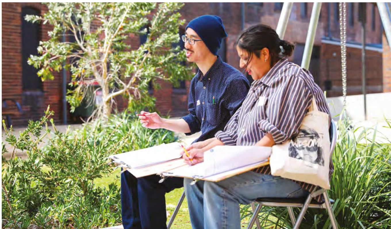
Drawing workshop held in Zetland.

The City of Sydney recognises there is an underlying social responsibility to remove barriers from the mainstream services it provides, the employment opportunities it provides to the community and the infrastructure and public spaces it manages.