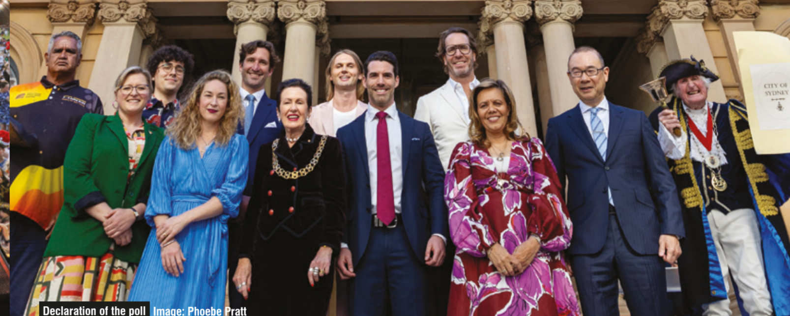
Declaration of the poll