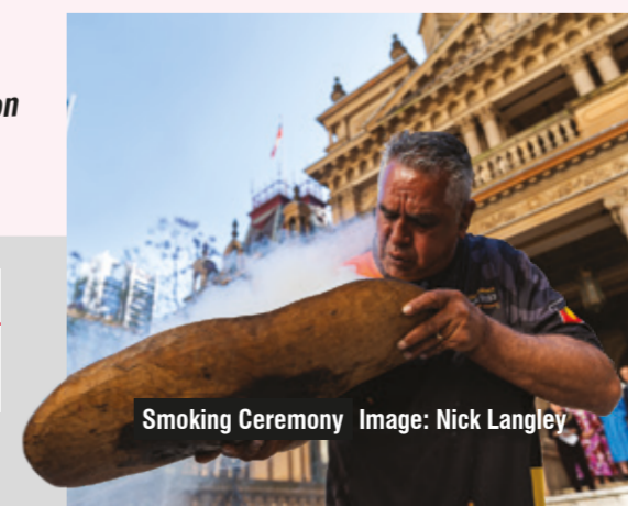
Smoking Ceremony

Clover Moore Lord Mayor of Sydney Clover Moore AO