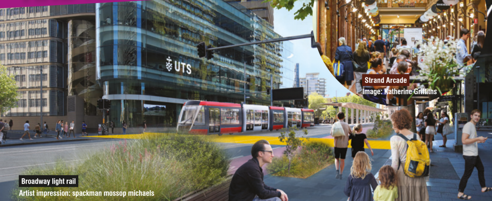
Broadway light rail Artist impression: spackman mossop michaelis