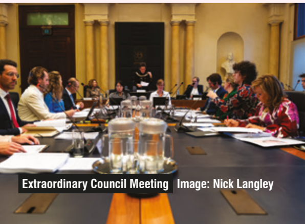
Extraordinary Council Meeting