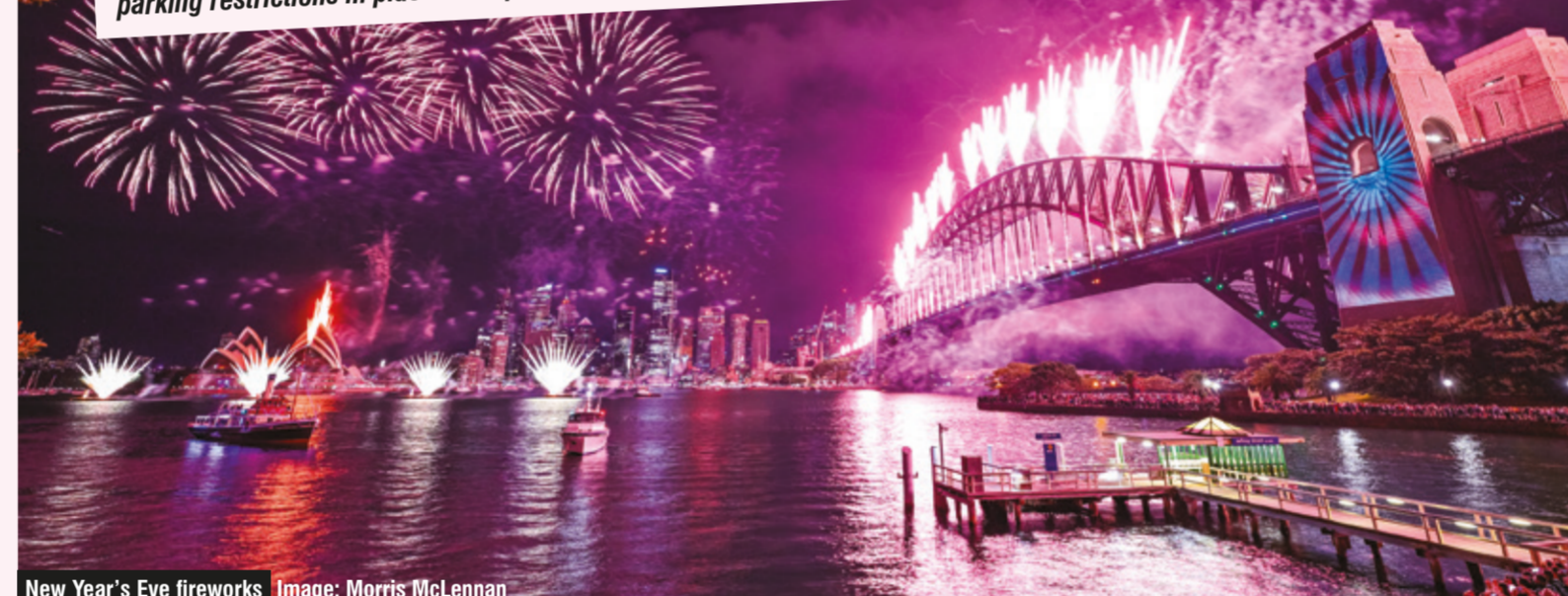
New Year's Eve fireworks

Most vantage points for New Year's Eve are free. There will be large crowds, so make sure you plan ahead and arrive early. This year's celebrations begin with a smoking ceremony on the harbour, before projections light up the pylons of the Sydney Harbour Bridge. 9pm features our Calling Country fireworks: a celebration of sky, land and sea, presented by the Aboriginal and Torres Strait Islander artists through music, dance and illustration. At midnight prepare to be dazzled by the world's best fireworks. It's going to be an amazing night for all. Be prepared as there are road closures, diversions and parking restrictions in place to help people get around safely. Visit sydneynewyearsve.com to plan your night.