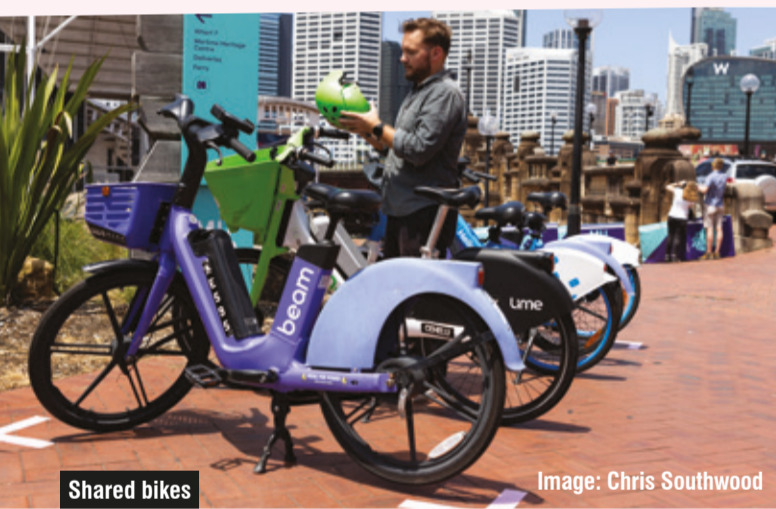
Shared bikes

Share bikes can play an important role in our transport mix, but currently, there are too many on our crowded footpaths. The City of Sydney has no direct power over the provision, regulation, or management of bike share schemes. Additionally, operators do not need permission to operate in our area, or park their bikes on our footpaths and other public spaces. While the City has developed voluntary guidelines and we are working with operators on parking zone trials, without a permit system, penalties can't be imposed on operators. Transport for NSW is currently developing options for regulating share bikes, and Council has called on the Government to introduce a permit system to cap the number of operators and bikes available and ensure better behaviour.