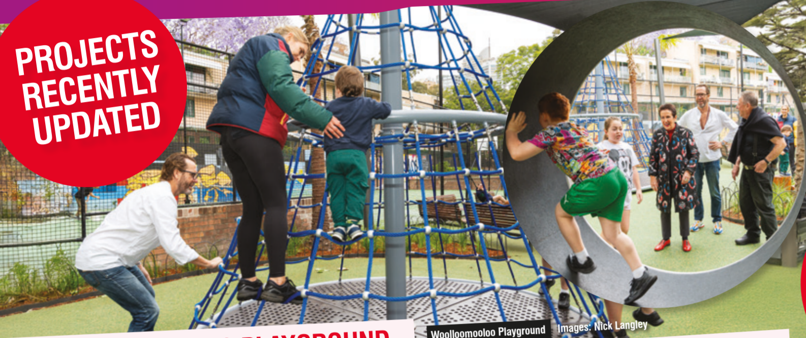
Woolloomooloo Playground