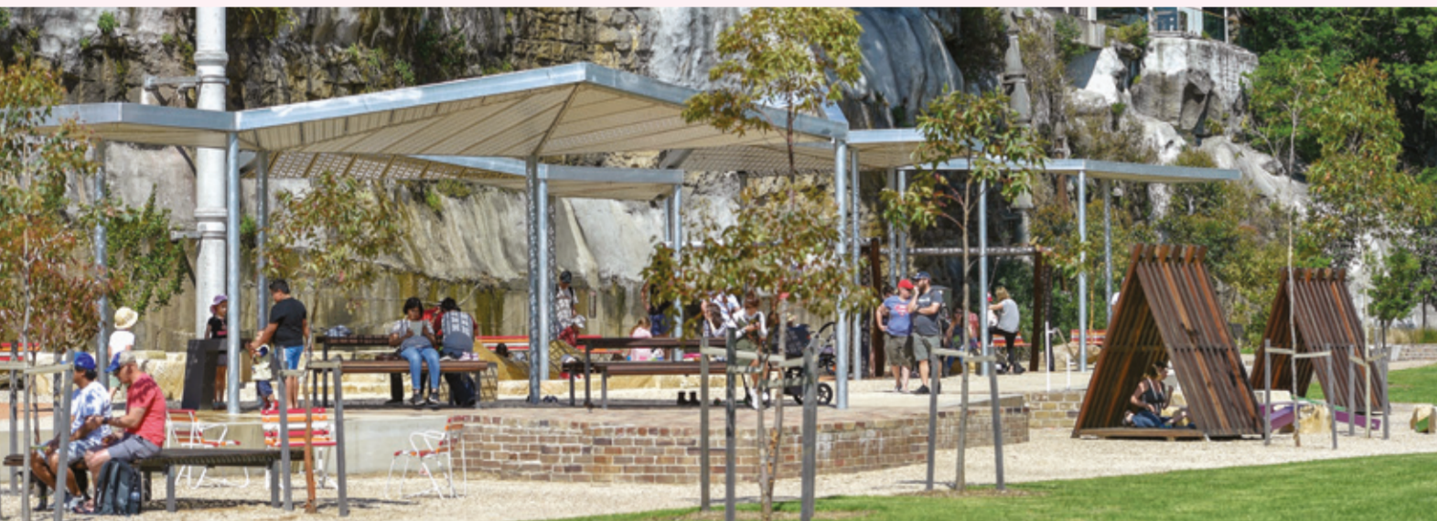
Forest Lodge