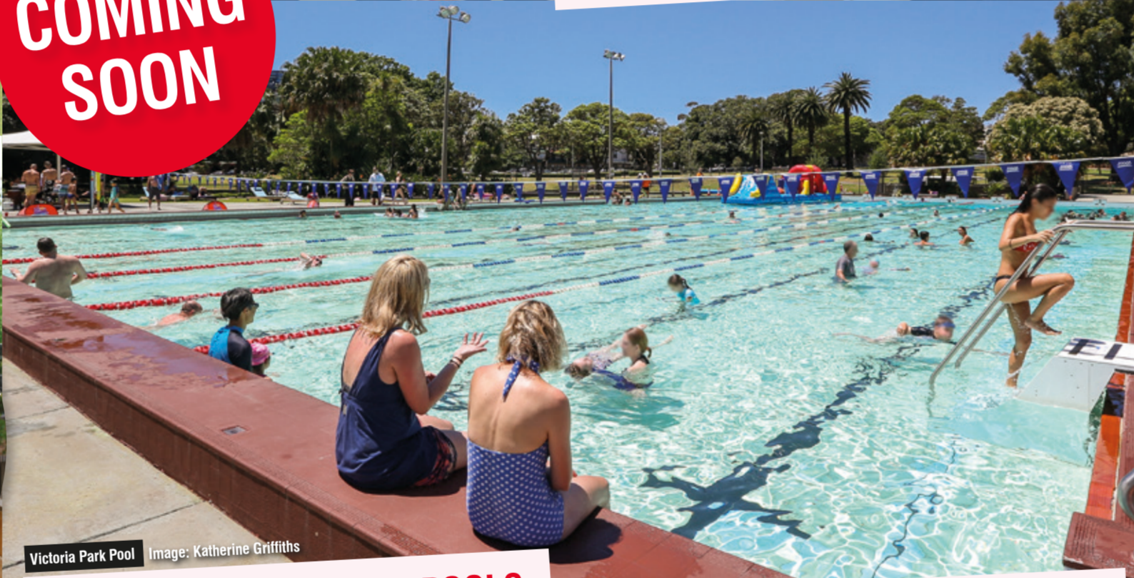
Victoria Park Pool