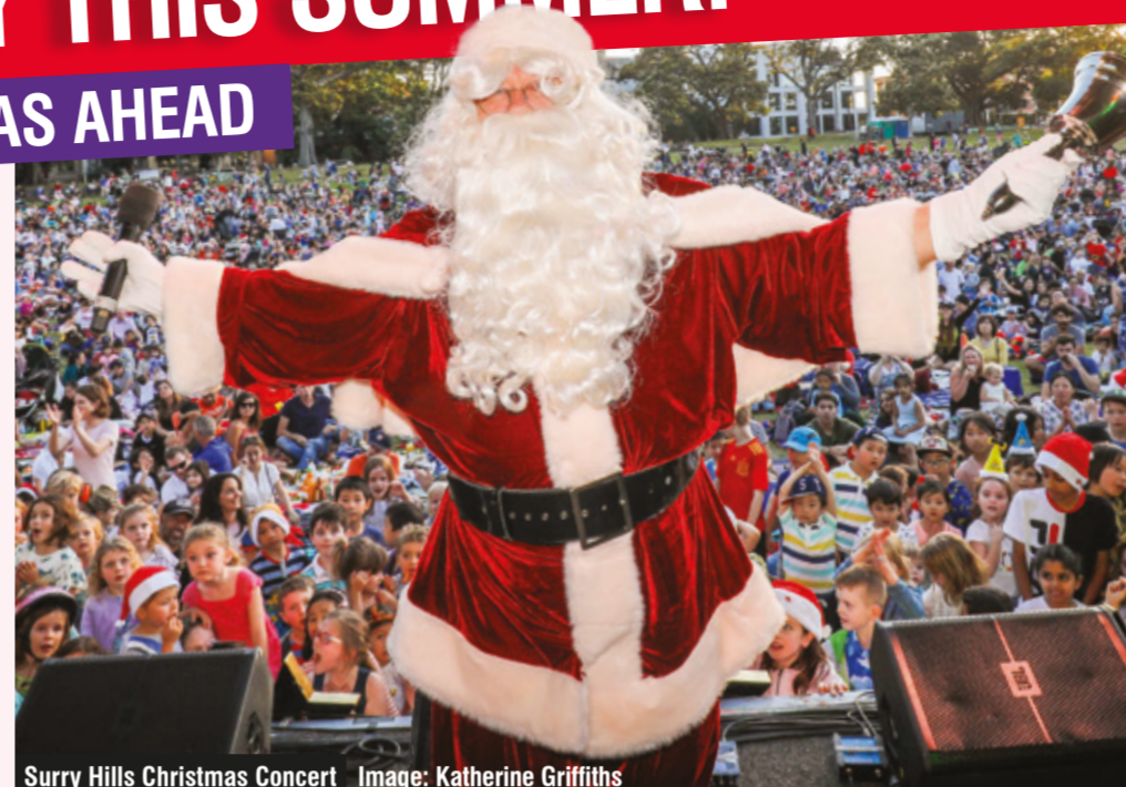
Surry Hills Christmas Concert

Join the Lord Mayor on her annual sleigh ride through the city with Santa and an 80-piece marching band. Visit the iconic Martin Place Christmas tree and sing along with our choirs, have your photo taken with Santa and treat yourself to an ice cream. Enjoy wandering our city streets this festive season. From markets to roving performers, our streets sparkle at Christmas time. Our much-loved concerts will return to Alexandria, Glebe, Pyrmont, Rosebery, Rushcutters Bay and Surry Hills. Find out more: sydneychristmas.com.au