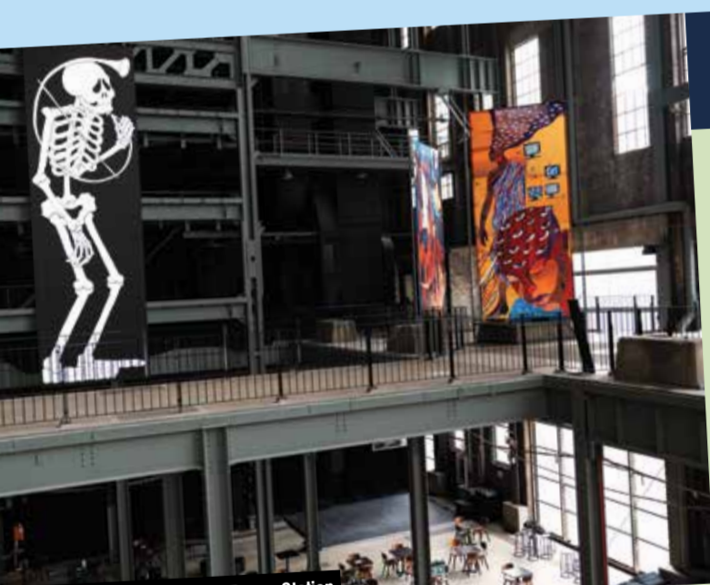
Biennale art at White Bay Power Station

Until 10 June, the 24th Biennale of Sydney, titled Ten Thousand Suns, ignites its transformative power of art across locations including the Art Gallery of NSW, Artspace, Chau Chak Wing Museum, Museum of Contemporary Art, Sydney Opera House, UNSW Galleries and the former White Bay Power Station. As a long-time sponsor, we have donated $1.3 million to the development and presentation of the 24th bi-annual event, helping this festival remain free and accessible. Certainly the highlight of this Biennale is the re-opening of the heritage-listed White Bay Power Station for the first time in over a century. Soaring installations breathe new life into this industrial landmark, transforming it into a canvas for contemporary expression. Catch a bus around the corner from Town Hall straight to White Bay. Free family days cater for all ages. Find the full program at biennaleofsydney.art