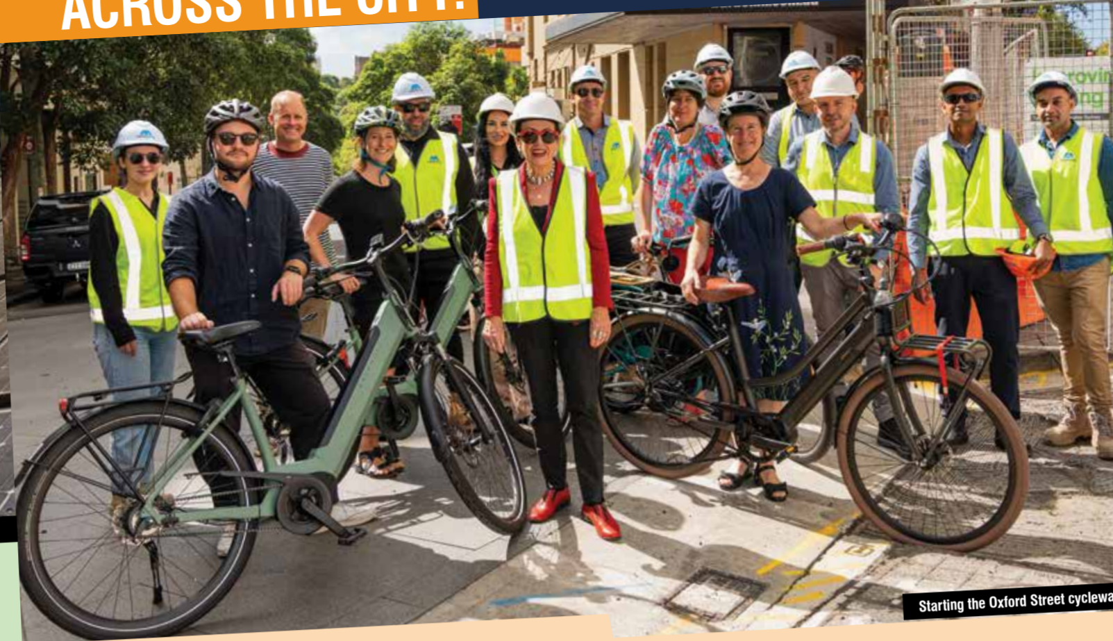
Starting the Oxford Street cycleway