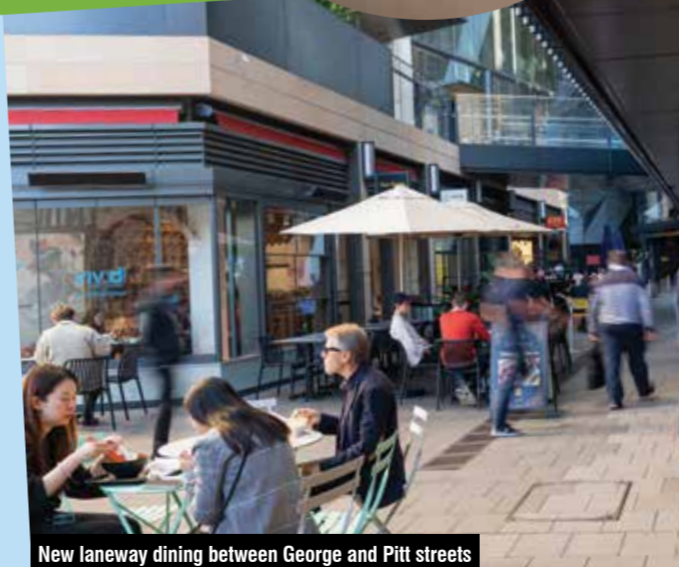
New laneway dining between George and Pitt streets