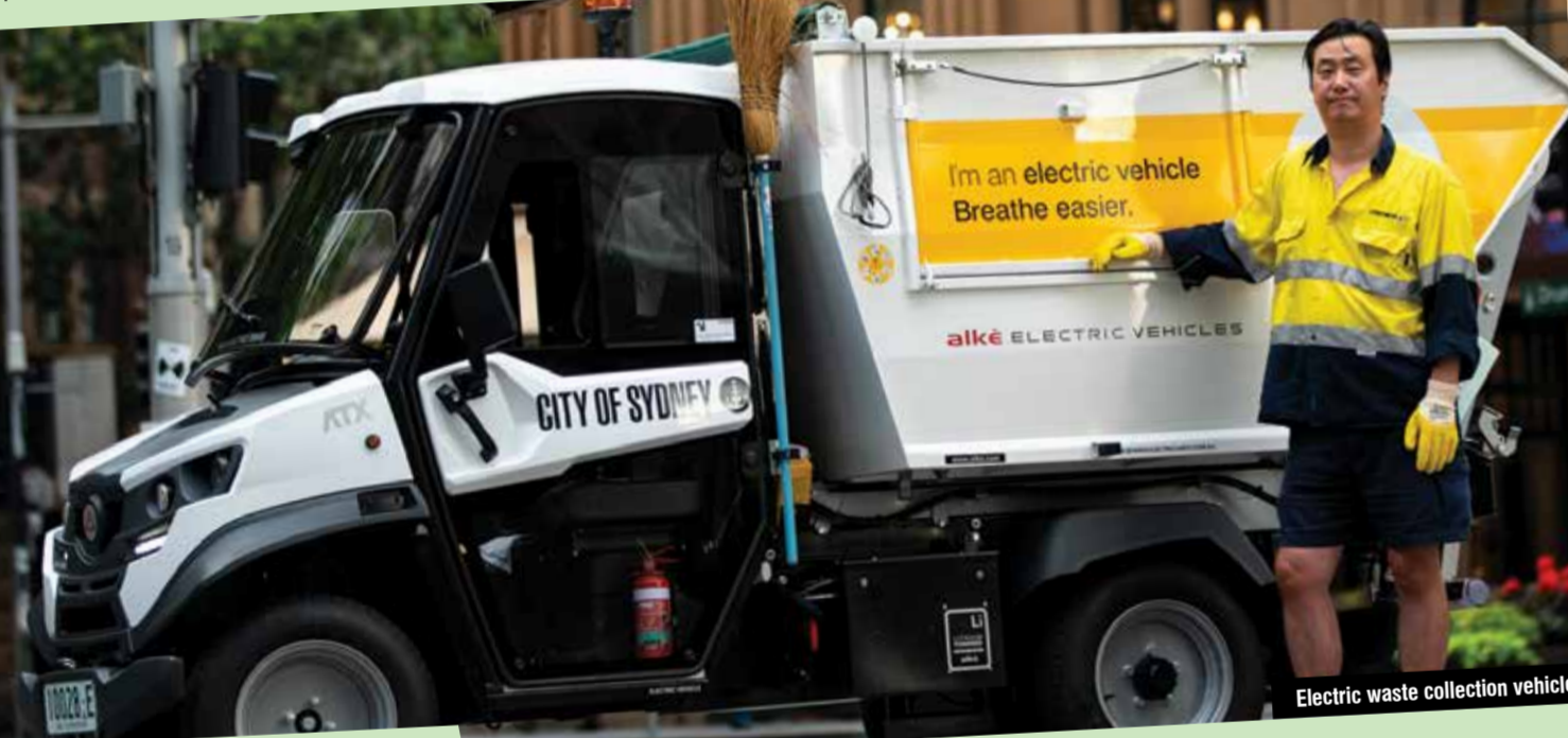
Electric waste collection vehicle

We were the first government in Australia to become carbon neutral. This was in 2007 and since July 2020, all of the City's operations have been powered by 100% renewable electricity.