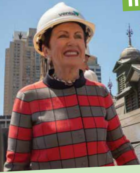
Clover inspecting solar panels on the Sydney Town Hall roof