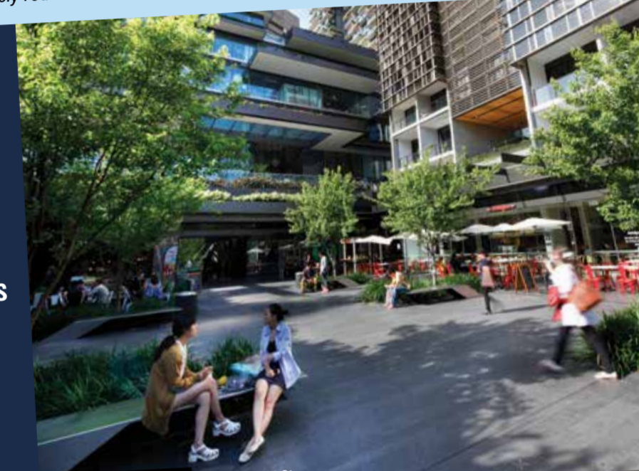
Central Park, Broadway

We will further electrify our own operations, including our pools, fleet and EV charging opportunities.