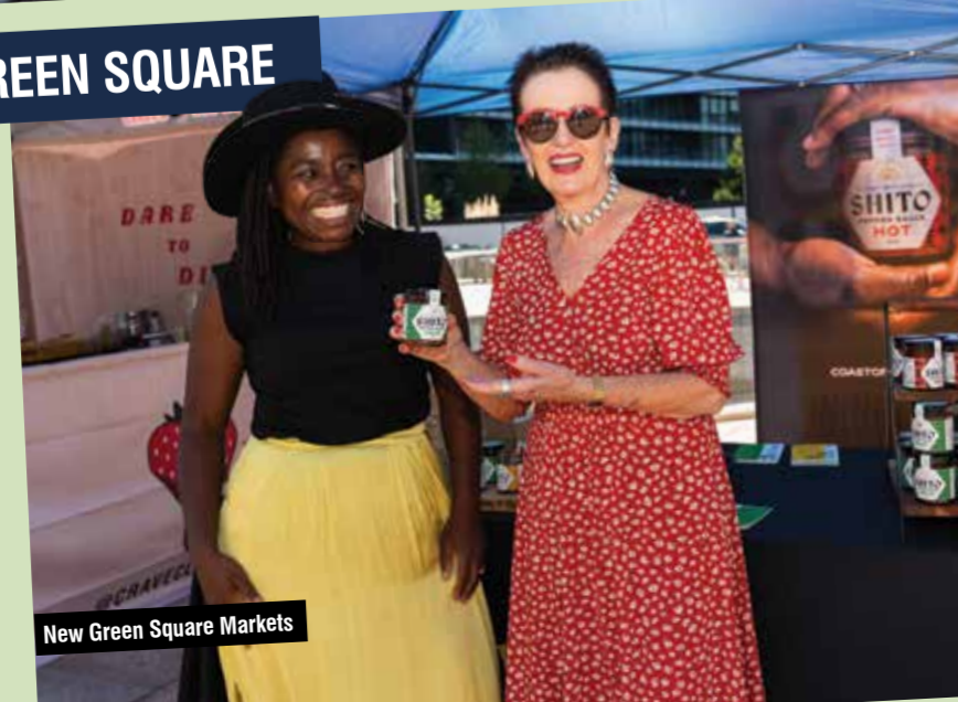
New Green Square Markets

Opened late March by the Lord Mayor, every Saturday there are more than 50 stalls selling a range of delicious fresh produce, baked items, gourmet hot foods, fashion and gifts as well as live music and activities for kids. This is helping to foster community and provide new opportunities for small businesses, local organisations and performers. Green Square Plaza is already a vibrant meeting place with its award-winning library at one end and the Drying Green Park at the other. Run by Cambridge Markets, this new weekly event is giving the plaza another focus, and providing locals with a new source of affordable, quality fresh food. See whatson.sydney for details.