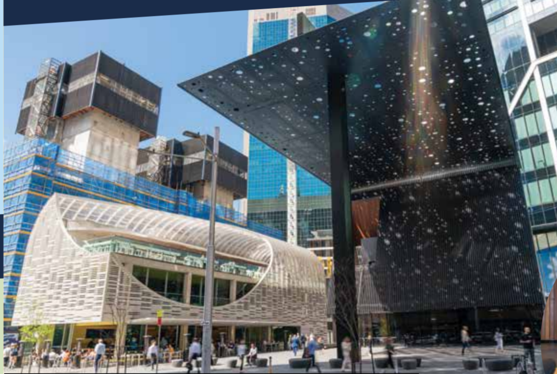
180 George Street Daniel Boyd artwork and Sir David Adjaye community and cultural building

Our latest community space is at 180 George Street, around the corner from Circular Quay. You can attend tai-chi, yoga and pilates classes before work or during your lunch break in this beautiful building, designed by Sir David Adjaye. Classes run for one hour and must be booked ahead of time – visit whatson.sydney/180-george to secure your space!