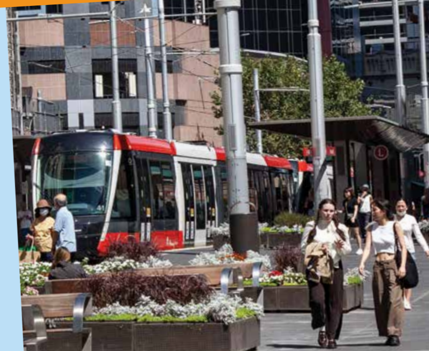
A transformed George Street

Most importantly there are people everywhere – sitting or walking, shopping or sipping coffee, conversing with colleagues or friends. It is one of our City's finest achievements.