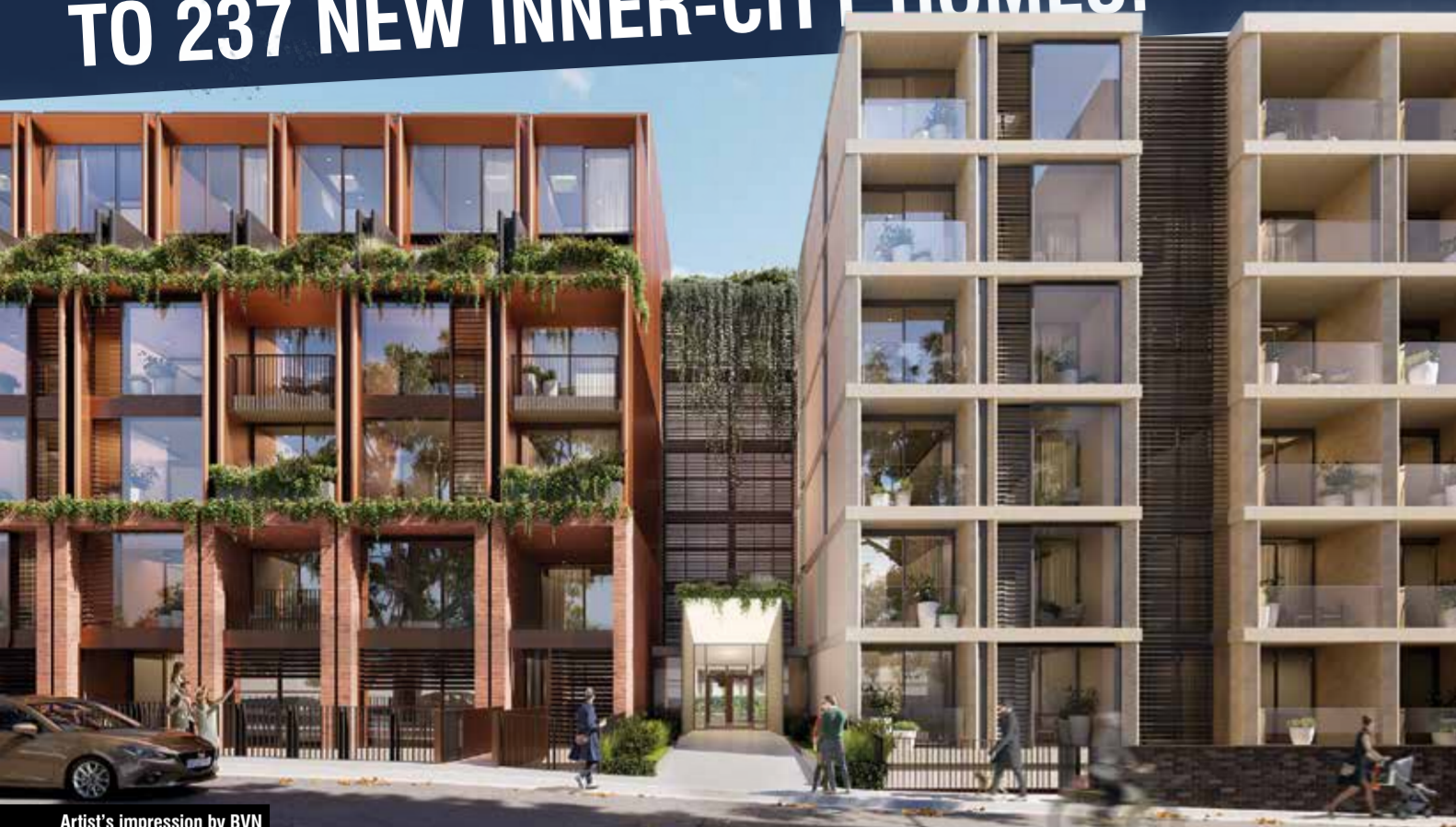
Artist's impression by BVN

The Central Sydney Planning Committee has unanimously approved the Development Application for the site of the former quarry known as 'Hellhole', and later Council depot, at Wattle and Fig streets, Pyrmont.