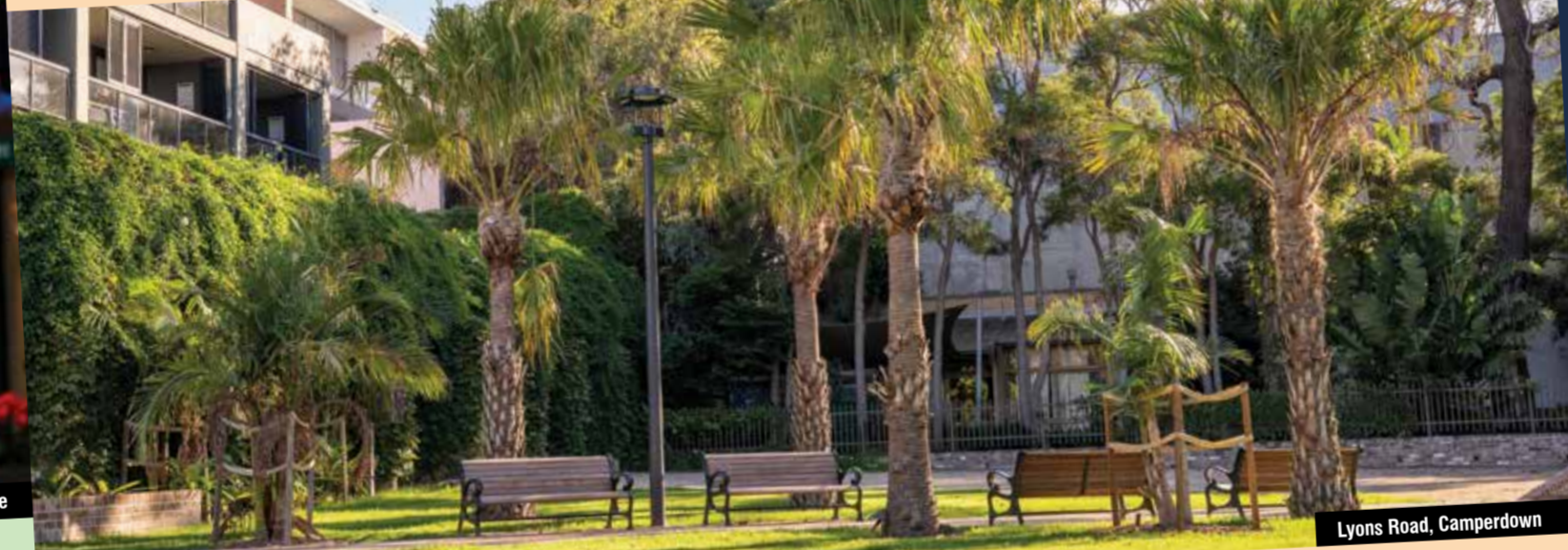
Lyons Road, Camperdown

Since 2007 we have delivered 25 kilometres of safe, separated cycleways, 66 kilometres of shared paths and other supporting cycling infrastructure. So now more than 10,000 people can ride safely to work in the city centre, the equivalent of 10 full trains or 166 full buses.