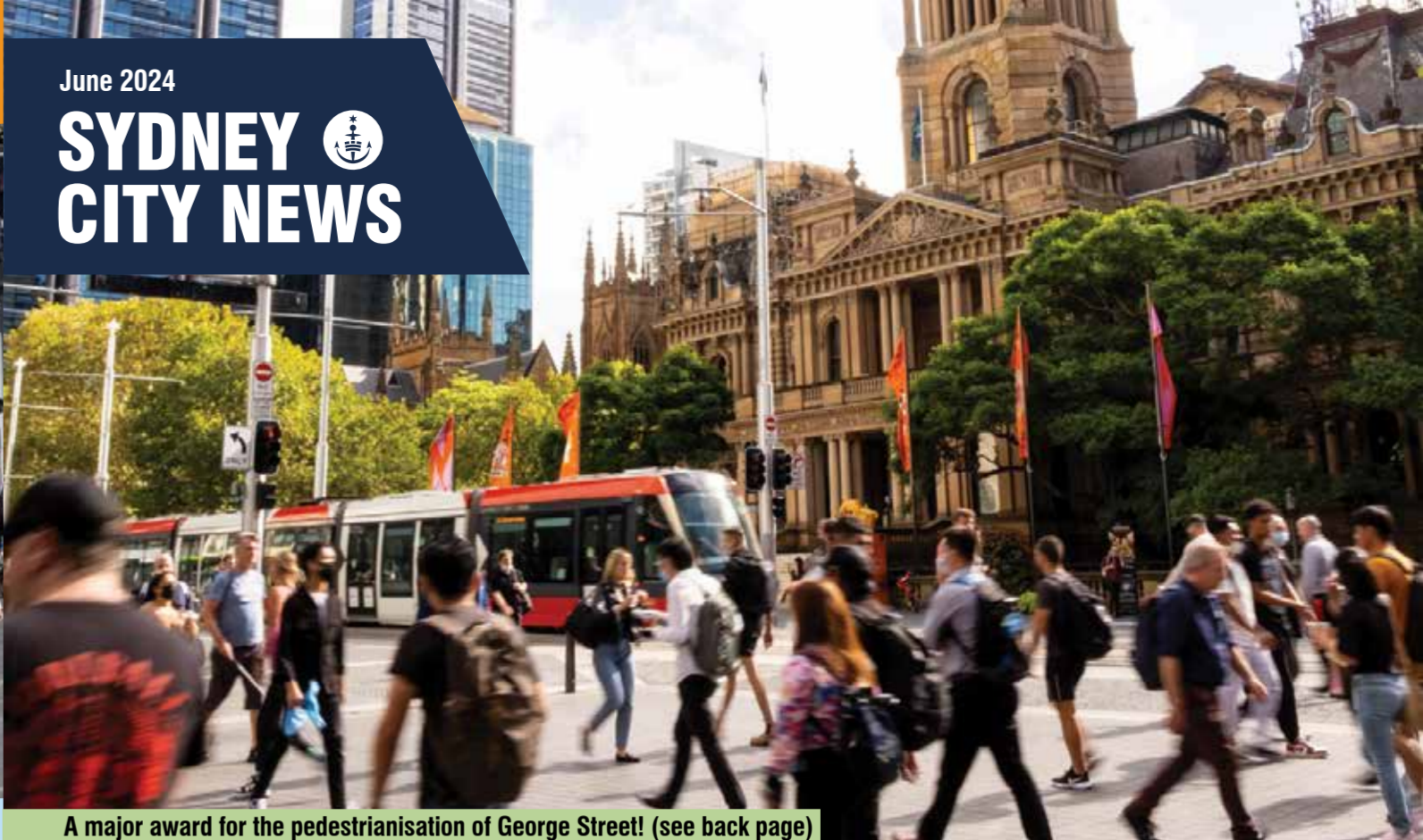
A major award for the pedestrianisation of George Street! (see back page)