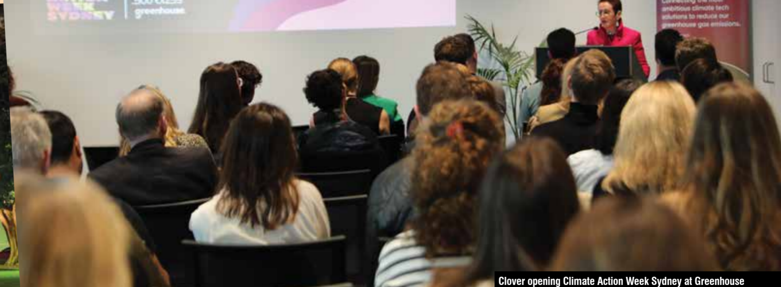
Clover opening Climate Action Week Sydney at Greenhouse